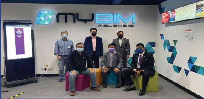
Group photo with CIDB IBS &amp; BIM division and CIDB e-Construct representatives