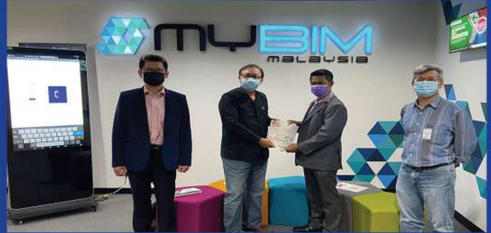
Presentation of memento to CEO of CIDB E-Construct

The courtesy visit and meeting on 9 March with CIDB e-Construct Services Sdn Bhd and CIDB IBS & BIM division discussed on Building Information Modelling (BIM) related issues in the Malaysian construction industry. CIDB e-Construct through myBIM centre provides Affordable BIM Training (ABT) programme which targets industry players like contractors, architects, engineers, and surveyors, to teach them the process of implementing BIM at construction site. From 2016 until now, myBIM centre has certified more than 2,000 BIM practitioners which includes BIM Modellers, BIM Coordinators and BIM Managers.