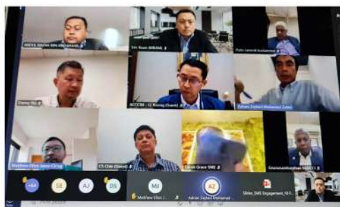
Screenshot of over 60 attendees