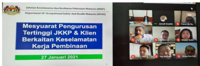
Snapshot of meeting attendees

The virtual meeting on 27 January was chaired by the Director General of Department of Occupational Safety and Health (DOSH) Ir. Zailee Dollah. DOSH is concerned about the high accident rate involving falling from height at construction sites with the record of 32.6% out of the total 144 fatality cases in year 2019. All the parties in the meeting voiced out their opinions on the possible root causes of falling from height accidents. In conclusion, the lack of awareness and insufficient training among site workers on dealing with risks of working at height are poor.