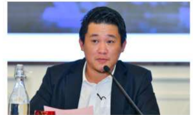
Here I am presenting the 2019 MBAM Annual Report