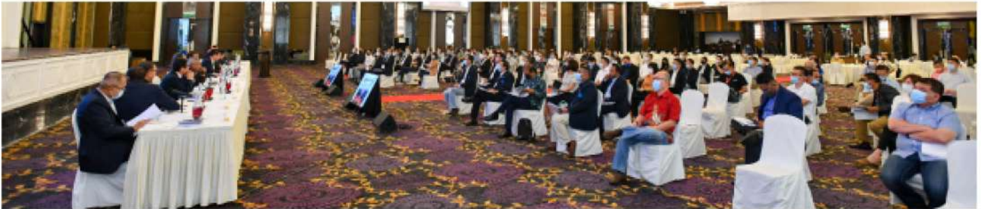
The 66 th MBAM AGM was conducted within SOP compliance

The 66 th MBAM Annual General Meeting (AGM) was held on 20 December 2020 at The Majestic Hotel, Kuala Lumpur. The event was originally planned to be held in June 2020 but was postponed several times due to the ongoing COVID-19 pandemic and various Movement Control Orders in Malaysia.