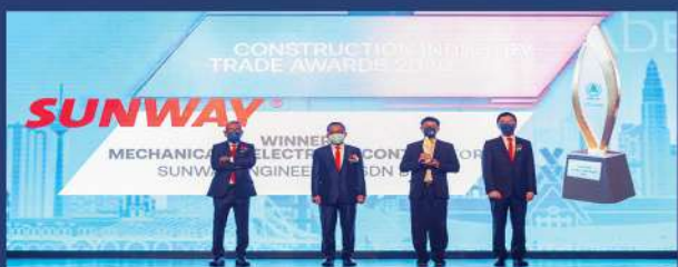
Winner for Mechanical & Electrical Contractor Sunway Engineering Sdn Bhd

The second edition of the Construction Industry Trade Awards (CITA) presentation by MBAM was also held during the dinner. The CITA was first introduced in 2019. One of its main objectives was to give due recognition to organisation who has contributed and demonstrated excellence in enhancing image, performance and improvement of the construction industry in their respective field of expertise. The 2021 MBAM CITA winners were as follows: