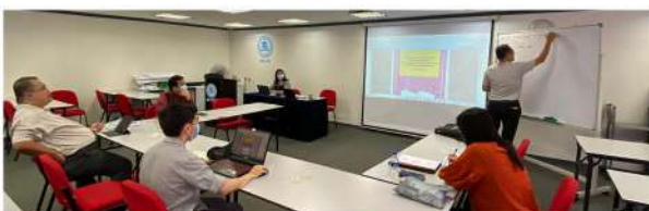
Discussion on SCP guideline