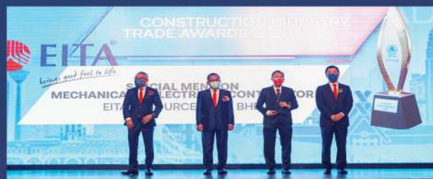
Special Mention for Mechanical & Electrical Contractor for Innovation in Vertical Transportation System Eita Resources Sdn Bhd