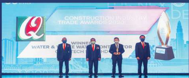
Winner for Water & Waste Water Contractor Qudotech Sdn Bhd