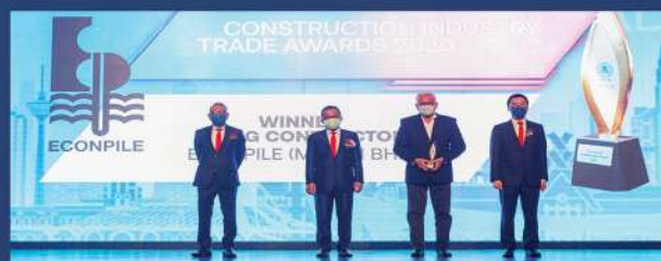
Winner for Piling Contractor Econpile (M) Sdn Bhd