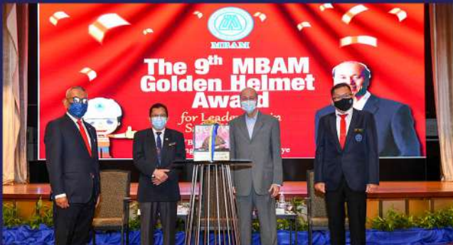
The Conferment of MBAM Golden Helmet Award 2021 to Tan Sri Lee Lam Thye (second from right)