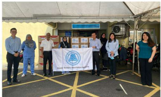
MBAM Donation for COVID-19 handover ceremony at Kepong District Health Centre

We would also like to thank all the donors for their generous contributions and support.