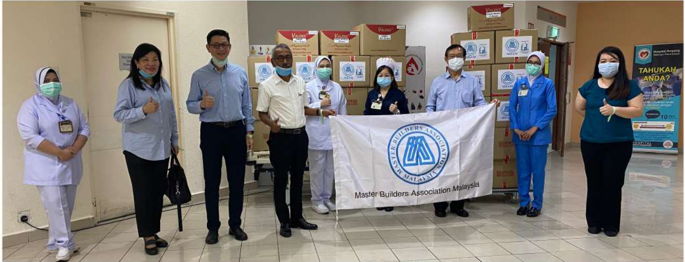
MBAM Donation for COVID-19 handover ceremony at Hospital Ampang

MBAM contributed RM100,000 worth of medical gowns, face shields and masks to Crisis Preparedness and Response Centre (CPRC) for COVID-19 namely the Kepong District Health Centre and Hospital Ampang in a handover ceremony on 30 April 2020.