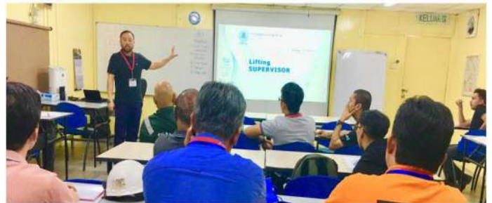
Day 1 lessons in class

The Day 2 training was conducted on ground with practical lifting activities. Trainees need to apply their technical knowledge into the actual lifting actions where communication with other lifting team members such as slingers, riggers and crane operator needed to be carried out effectively.