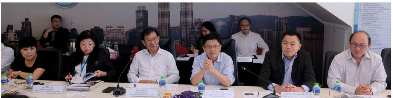
During the Dialogue session with BMDam and NRMCA