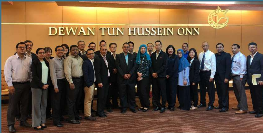
Group Photo with the meeting attendees