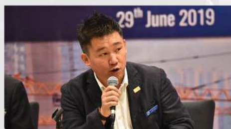
Here I am presenting the MBAM 2018 Annual Report

The members at the AGM approved all the resolutions including the proposed amendments to the existing clause 8.7 of the Constitution of the Association and the budget of RM3.0 million for the Phase 1 of the development of MBAM Centre of Excellence.