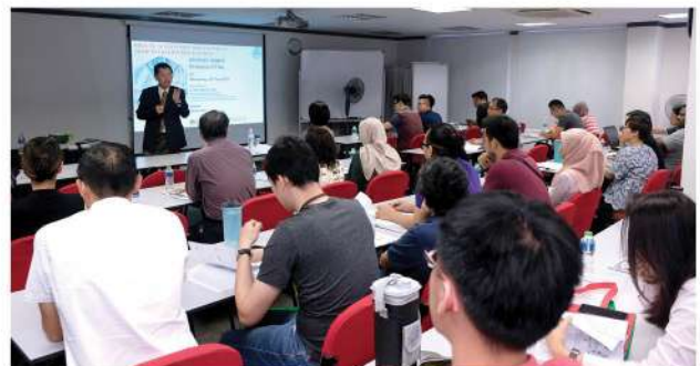
Session 3 training in progress

It is very important when deducting liquidated damages to ensure that the correct contractual procedures are adhered to. Overall, it was an interesting programme with strong participation by the attendees for the topic presented.