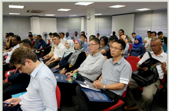
The participants attended for the talk