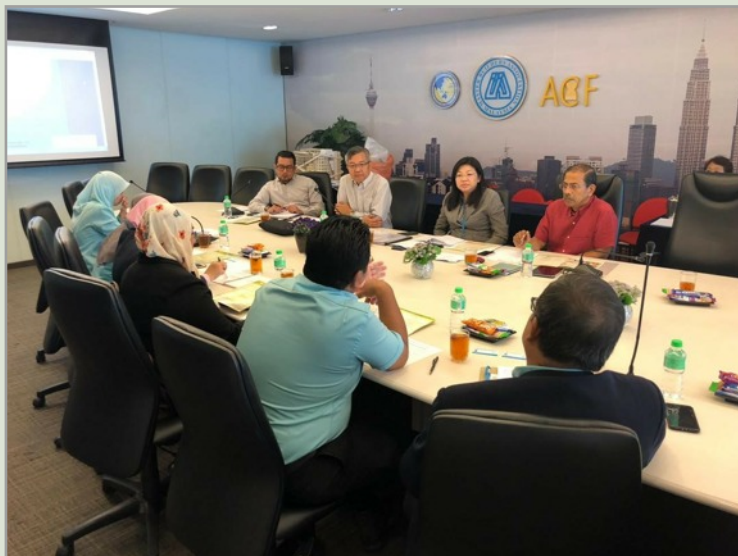
MBAM and CIDB representatives during the meeting