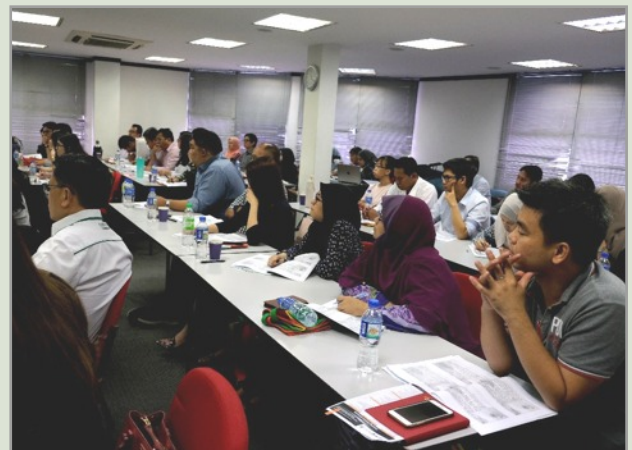
Participants at Contracts & Practices Programme 5: Loss And Expense On 27 th September 2018

The programme was interesting and gave participants a chance to clarify matters with regards to the topic of loss and expenses.