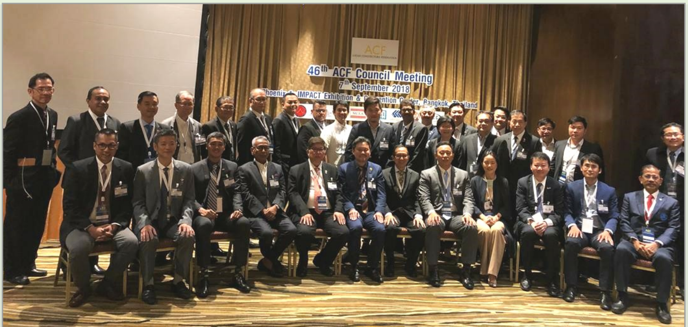
ACF Delegates at Renaissance Bangkok Ratchprasang Hotel.

I presented the paper on behalf of MBAM followed by other ACF members who presented their latest country reports. MBAM also took the opportunity to present the 44 th International Federation of Asian and Western Pacific Contractors' Associations (IFAWPCA) Convention promotional video to the ACF delegates and invited them to participate in the convention schedule from 12 th – 16 th November 2018 in Kuala Lumpur, Malaysia.