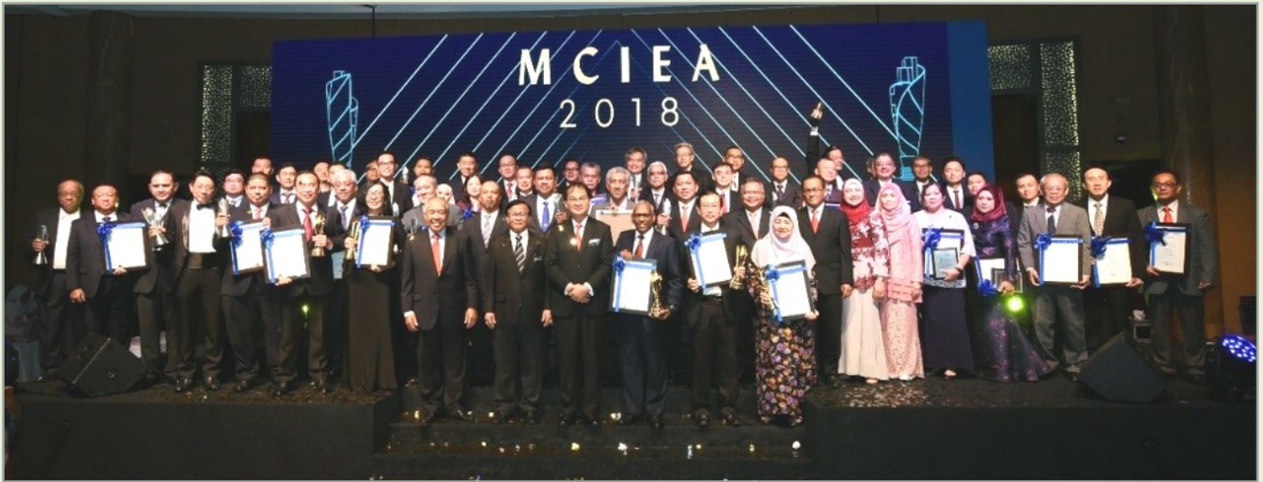
The award winners of the night at The MCIEA Awards 2018