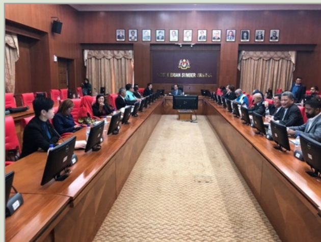
Discussion on management of foreign workers

Due to time constraints, all stakeholders were given timeline and deadline to propose recommendations and other related issues to be submitted on 10 th September 2018.