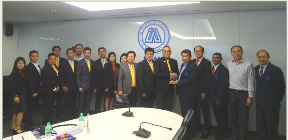
Group photo of PMBBMDA and MBAM representatives

The meeting was fruitful with both sides updating each other on the current news. We hope to work together for the betterment of the industry.