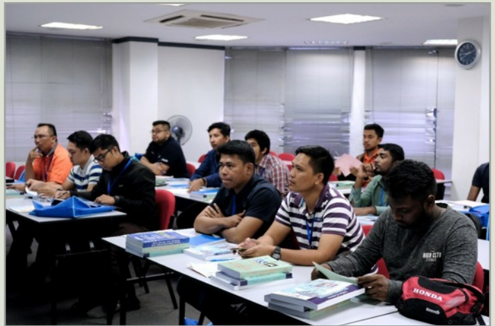
Participants at Site Safety Supervisor (SSS) Course Kuala Lumpur 70 th Intake

Construction Industry Development Board (CIDB) contractors will be eligible to earn 20 Contractor Continuous Development (CCD) points with this SSS course.