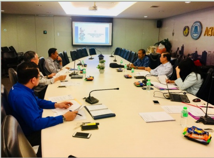
HR Committee Members discussed on management of foreign workers proposal to ILMIA

A discussion on proposal of management of foreign workers for Institute of Labour Market Information and Analysis (ILMIA) was held on the 20 th September 2018 at Tan Sri Datuk Tee Hock Seng Conference Room. ILMIA requested from the industry on the proposal related to management of foreign workers during the pre-council management of foreign workers independent committee with stakeholder meeting on 19 th September 2018.