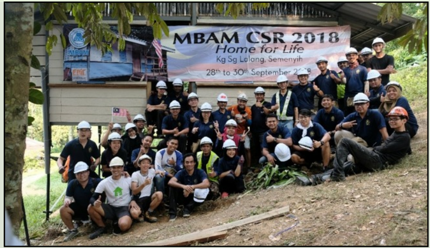
Group Photo at MBAM CSR 2018 – Home for Life at Kg Sg Lalang, Semenyih