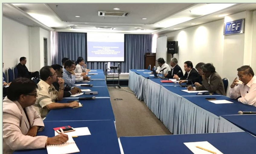
MEF Members meeting on levy to extend employment skilled foreign worker beyond 10 years

MEF members decided to prepare proposal on the payment on yearly basis of the levy such as RM10,000 for three years, for employer is RM 5,550.00 as levy for three years and for employee (foreign worker) is RM 4,450.00 as a levy for three years.