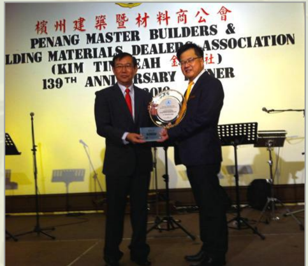
Souvenir exchange between MBAM and PMBBMDA

In the MBAM President's speech, he touched on the friendship between MBAM and PMBBMDA and the shared interest to work together for the benefit of the construction industry as well as to solve the many issues affecting the members of both associations. The construction industry have been experiencing a continuous double digit growth since 2012 and the first quarter 2016 and second quarter 2016 recorded 7.9% and 8.8% growth respectively. MBAM has taken a proactive role to work together with Ministry of Home Affairs, CLAB, CIDB and institutions of higher learning, which range from seeking a stable policy on the recruitment of foreign workers to working together to encourage and train local workforce to match the industry's needs. An exchange of mementos between both the Presidents of PMBBMDA and MBAM was held to commemorate the occasion.