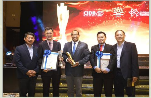
The MBAM Council Members and the winners of the MCIEA 2016