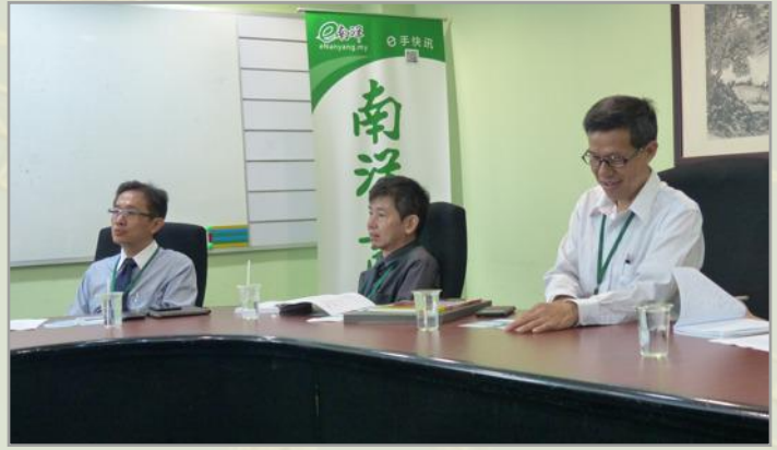
The representatives from Nanyang Siang Pau