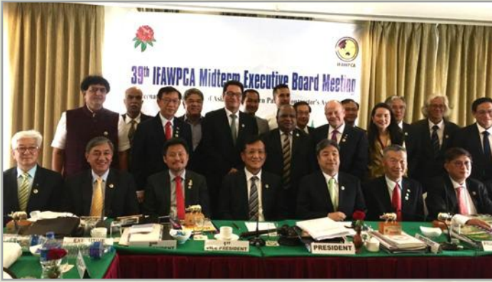
Group photo with the Board Members