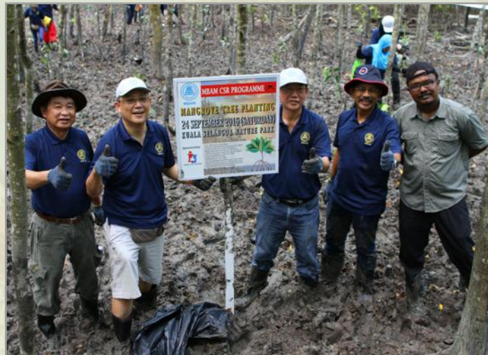
MBAM Council Members with the MBAM signboard

This year's CSR programme was kindly sponsored by Ikhmas Jaya Sdn Bhd. A number of other companies also contributed to ensure the success of the programme. They were as follows: