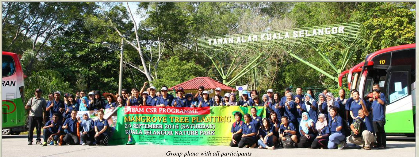
Group photo with all participants

Spending the day close to the nature left us feeling refreshed and we departed Kuala Selangor feeling hopeful that one day we might return to see the fruit of our labour grow and mature to be part of the nature park's complex ecosystem.