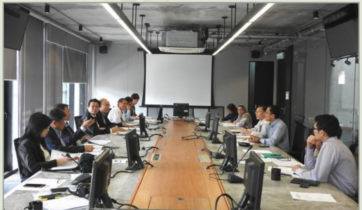
Board meeting at PAM's new building