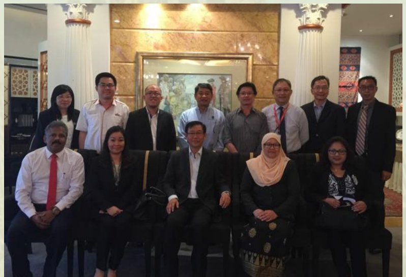
Group photo with the Malaysian International Builders committee

It was noted that presently the participation of Malaysian International Builders in the international business is shrinking due to various reasons as follows:-