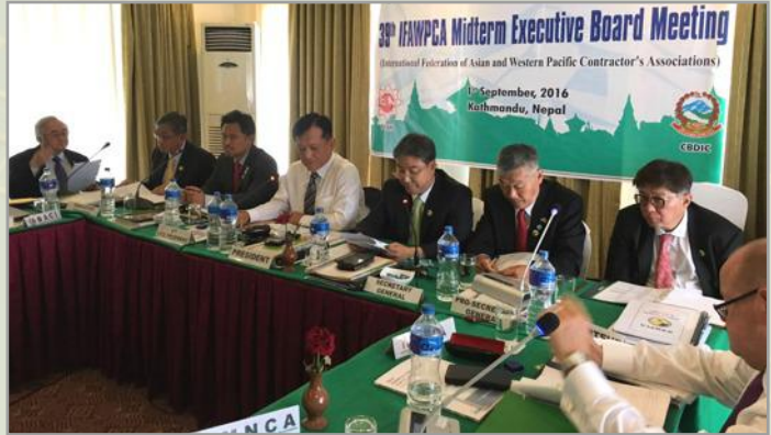
During the 39th IFAWPCA meeting

Nepal from 31 st August 2016 to 1 st September 2016. This Executive Board meeting was hosted by the Federation of Contractors' Association of Nepal (FCAN) and had attracted over 70 delegates from 17 countries and regions who came to exchange views on current and important issues related to the construction industry.