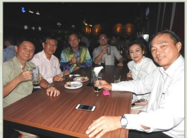
Among the familiar faces during the fellowship gathering