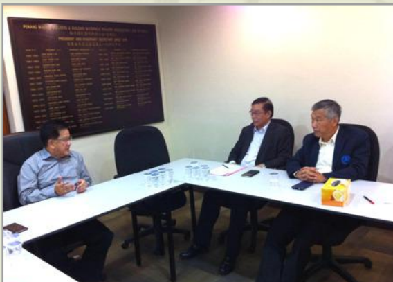
Dialogue in session

association's constitutions and bylaws were raised and MBAM agreed to forward to PMBBMDA a soft copy of their constitutions and bylaws for them to adopt wherever applicable. MBAM have also agreed to 'like' PMBBMDA's Facebook page after being invited by them.