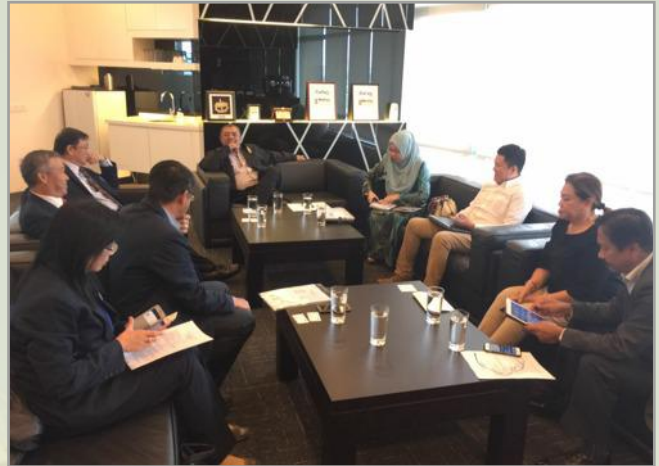
A laid back meeting session with Datuk P.S. Jaya