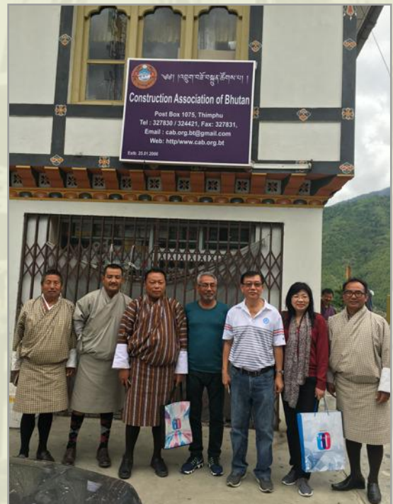
In front of the Construction Association of Bhutan's office