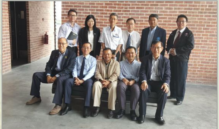
Group photos with the BIPC members