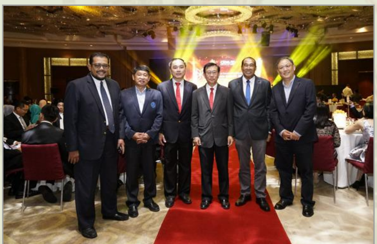
MBAM Council Members at the MCIEA 2016

The main objectives of the awards were to recognise individuals and/or organisations who have contributed