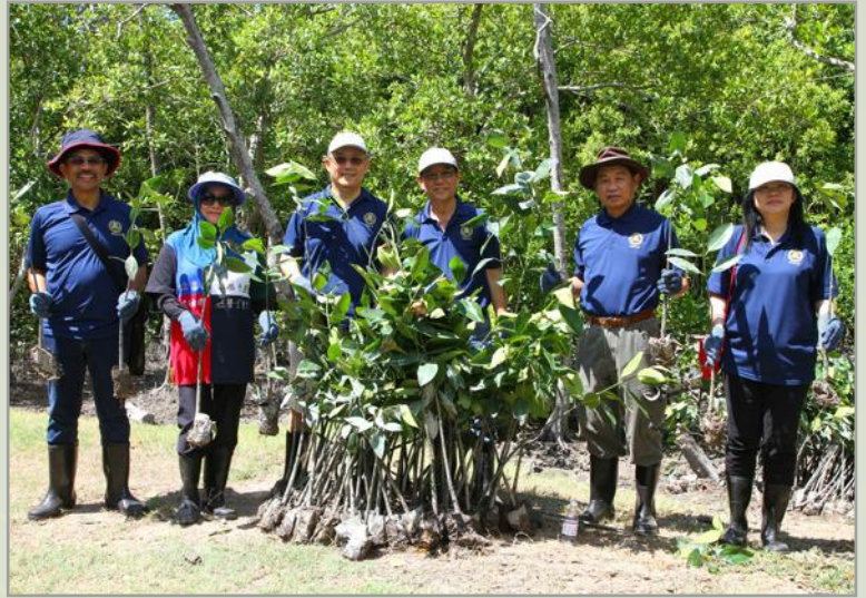
A part of the mangrove tree saplings that will be planted

When a wildlife habitat area in Kuala Selangor was proposed to become a new golf course in 1987, MNS stepped in and instead established it as a nature park. Now the Kuala Selangor Nature Park or KSNP thrives as a tourist destination and educational resource, instilling interest and understanding for the area's unique habitats. It has since become a sanctuary to many species of flora and fauna such as the endangered Silvered Leaf Monkey ( Presbytis cristata ) which KSNP has adopted as its logo.