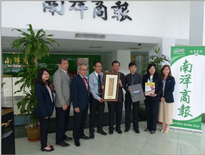
A memento was presented to mark MBAM's Courtesy Visit to Nanyang Siang Pau

The following are among the issues highlighted during the visit:-