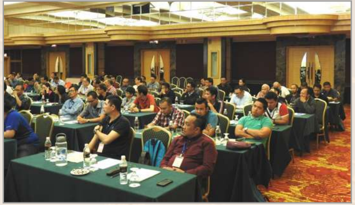
Snapshot of the attendees of the Seminar

On 27 th and 28 th October 2016, MBAM Safety and Health Committee together with the Sarawak Building & Civil Engineering Contractors Association (SBCECA) jointly organised a 2-Day Seminar on Occupational Safety & Health (OSH) and Hazard Identification, Risk Assessment & Risk Control (HIRARC) in Construction Industry for safety personnel in the Construction Industry at Imperial Hotel, Miri, Sarawak. The seminar was attended by more than 130 participants.