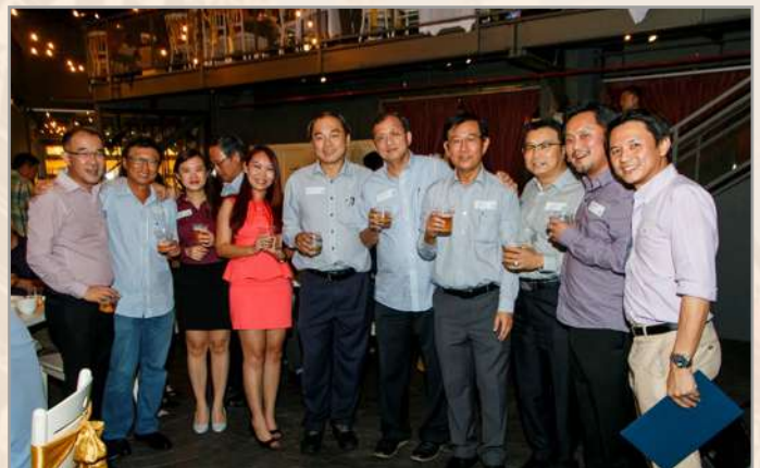
Council members are having a jolly time with the guest at the fellowship