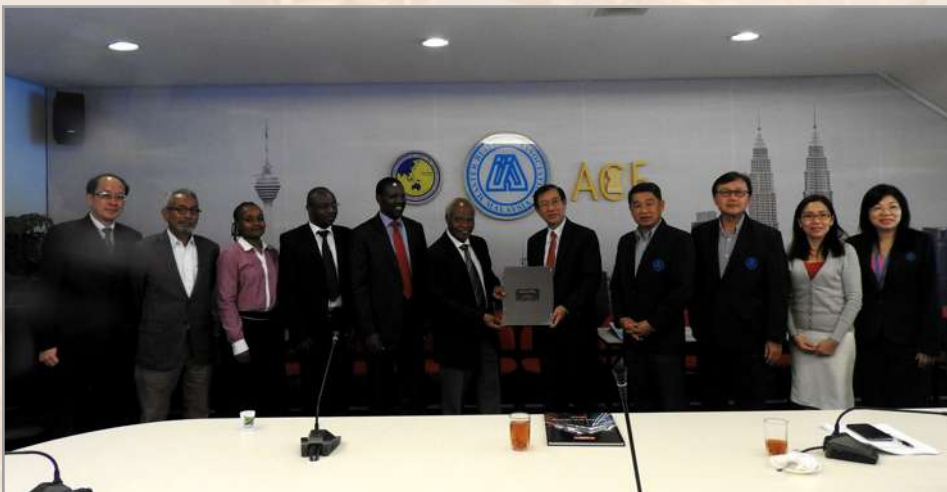
Presenting the MBAM 60 th Coffee Table Book as a token of appreciation

TACECA is currently undertaking a study to assess the impact of delayed payments on construction business with the intention to propose measures to mitigate the negative impacts. MBAM shared our initiatives especially on Construction Industry Payment and Adjudication Act (CIPAA) and the steps and efforts to realise the Act.