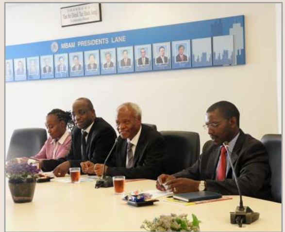
Representatives of the Tanzania Civil Engineering Contractors Association (TACECA)