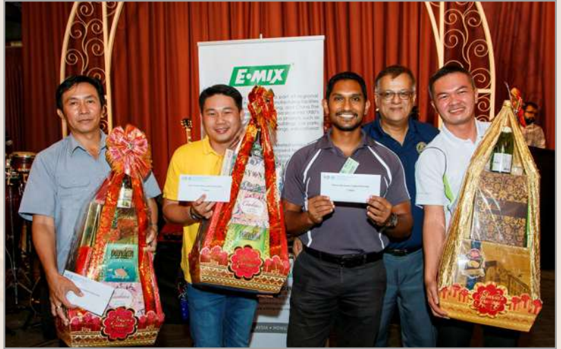
Winners of the MBAM Mini Darts Competition