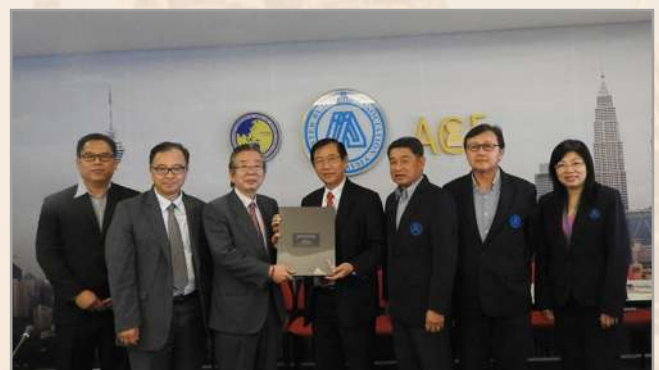
Group photo during the souvenir presentation

ENAA is a non-profit organization established in 1978 with the support of the Japanese Ministry of International Trade & Industry (the present Ministry of Economy, Trade and Industry (METI)) with the aim to develop diversified activities such as advancement of technological capabilities and promotion of technical development. It is also contemplated herein to assume the role of Front Runner to establish a social system in harmony with the development of social economy and environment through participation of a number of enterprises engaged in engineering business under the close cooperation with the government, academia and industry.