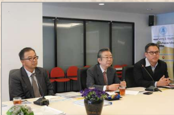
The representatives of ENAA