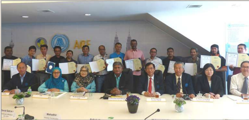
The graduates of the 7 th intake of the C OCD Programme

The programme were fully funded by the Construction Industry Development Board Malaysia (CIDB) with the primary objective to certify and register construction site personnel in particular site supervisor, site agent and site foreman. It is also MBAM's intention that through this formalised construction competency training programme, the construction practitioners especially construction site personnel would have a better career development and advancement opportunity.