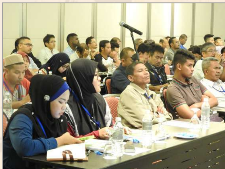
Among the participants attending the seminar