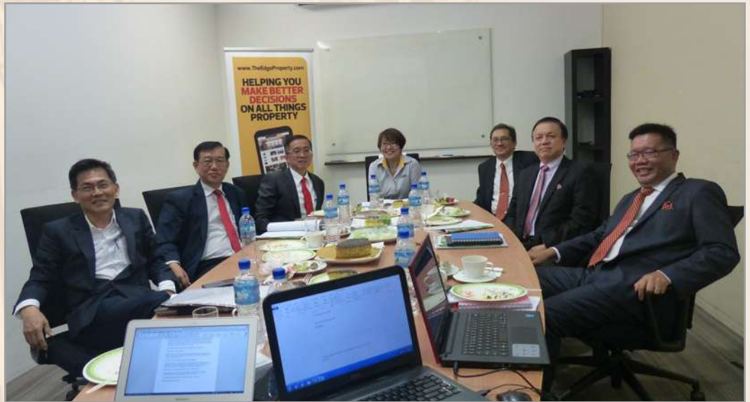
The panelist of the Roundtable meeting

The industry players also stressed that property prices hinge on numerous costs, the major ones being land, construction, compliance and labour. Overall, it does not seem likely that