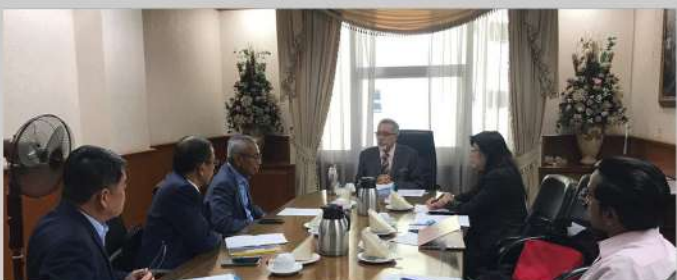
In discussion on issues raised