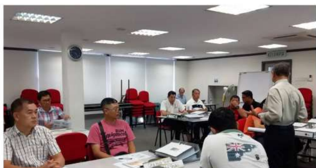
Participants during the discussion