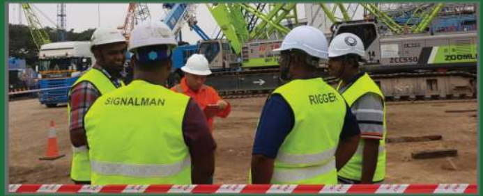
Participants during the practical lifting activities

Day 1 of the training focused on the technical knowledge required in order for trainees to apply and perform during the lifting activities. Day 2 of the training was conducted on ground with practical lifting activities. Trainees applied their technical knowledge into the actual lifting actions and communication with other lifting team members such as slingers, riggers