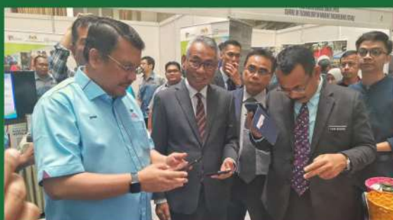
Tan Sri Sufri (middle) visiting some of the exhibition booths