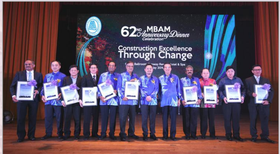
Group photo with the platinum sponsors of the 62 nd MBAM Anniversary Dinner