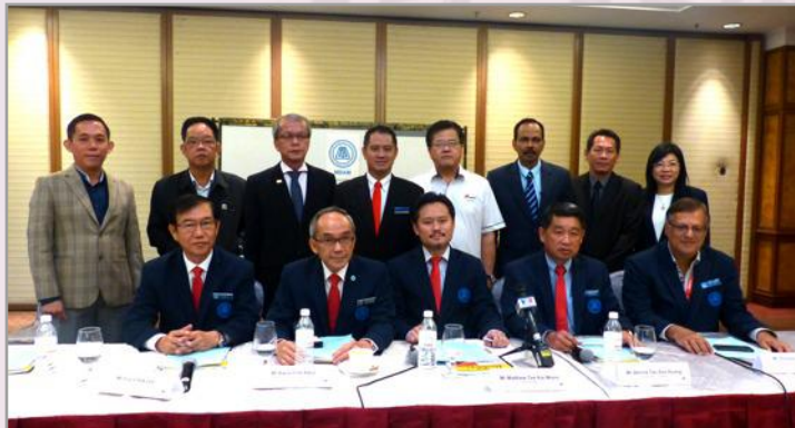
Group photo during the Press Conference