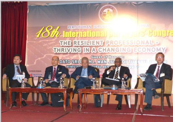
Among the panellist at the Presidents’ Talk