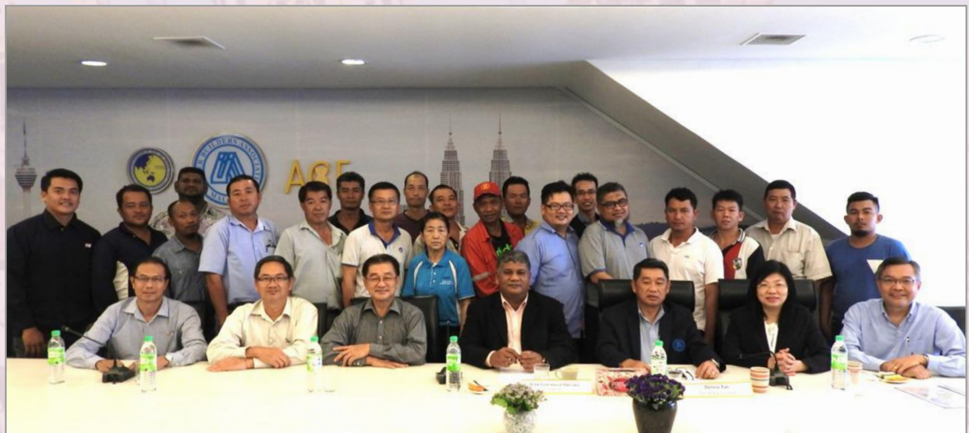
The group photo with the trainees of the COCD Programme