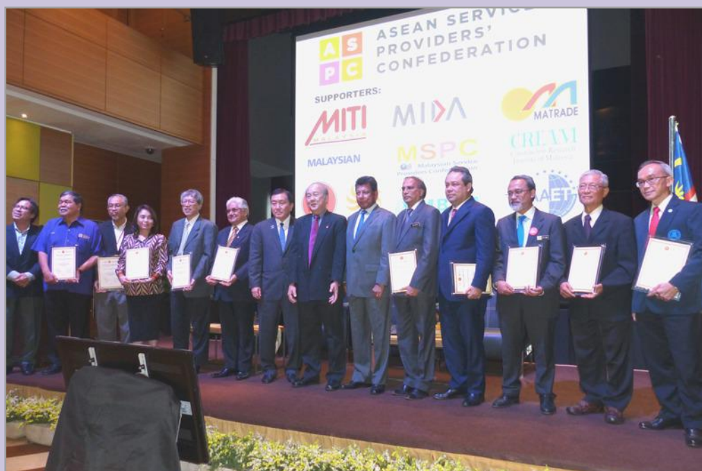
Presentation of Certificate of appreciation for the supporters of ASPC