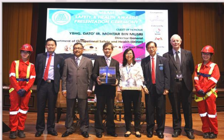
The recipients of the MBAM Safety & Health Awards 2016