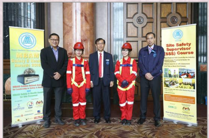
MBAM Safety & Health Committee Members