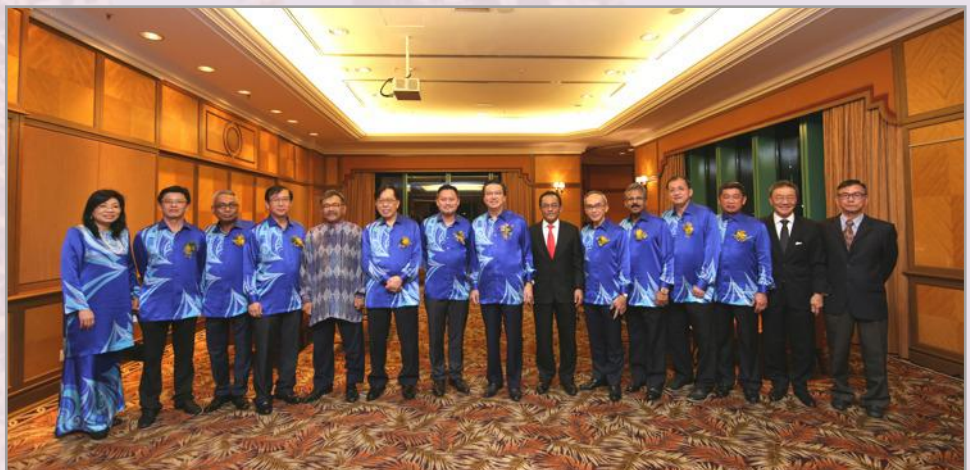
Group photo with the Guest of Honour, YB Dato' Sri Liow Tiong Lai