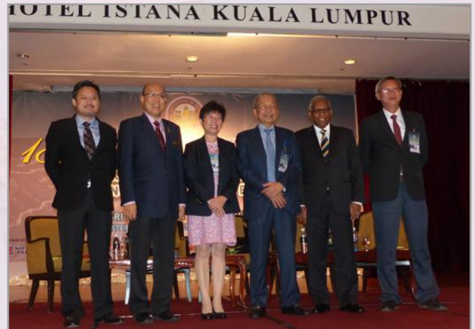
Group photo of the panellist from MBAM, IEM, RISM & SISV at the Presidents’ talk