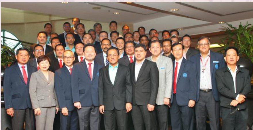
MBAM members and associates in a group photo at the MBAM Affiliate Dialogue 2016

The following were among the topics discussed at the Dialogue:-