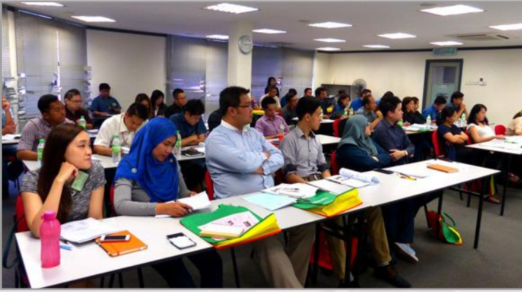
The participants listening attentively at the seminar