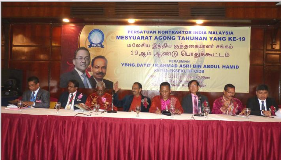
A photo taken during the PKIM AGM

PKIM has been an affiliate member of MBAM since the year 2000. The relationship between MBAM and PKIM provided an opportunity for both parties to come together and work towards the common good of the Malaysian construction industry. Other issues touched on in his speech include the effort to continually enhance collaboration with Agencies whether Private & Government such as the Construction Industry Development Board Malaysia (CIDB), the Ministry of Works, Malaysia, Ministry of International Trade and Industry, Malaysia and Ministry of Human Resources, Malaysia, just to name a few, so that the construction industry can quickly resolve issues affecting us as a whole.