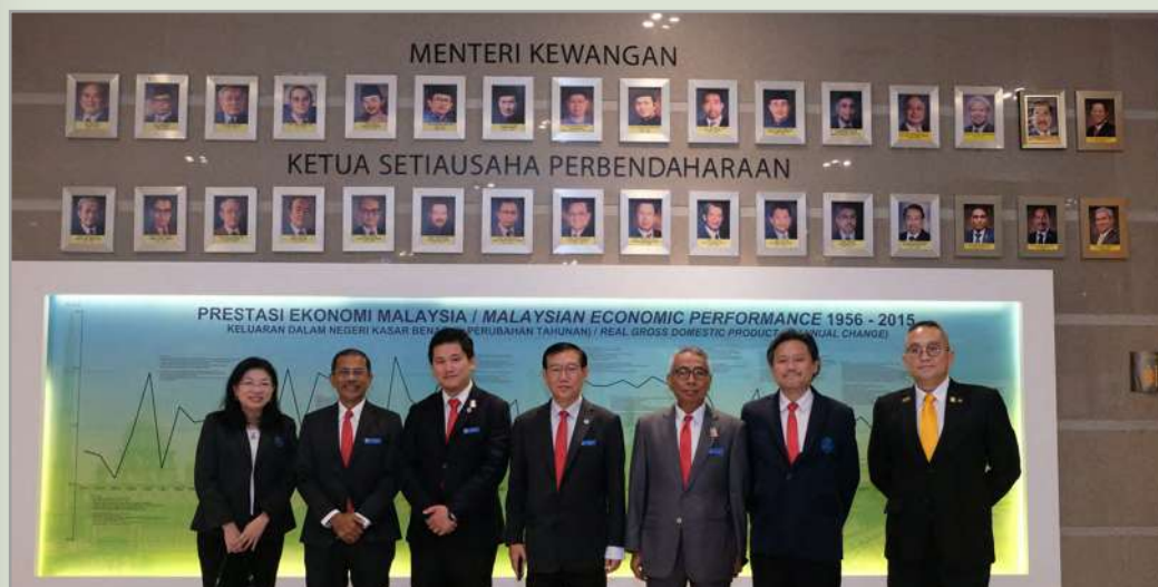
MBAM Delegation for the Courtesy Visit to the Minister of Finance Malaysia, YB Tuan Lim Guan Eng

Published by : MASTER BUILDERS ASSOCIATION MALAYSIA PERSATUAN KONTRAKTOR BINAAN MALAYSIA