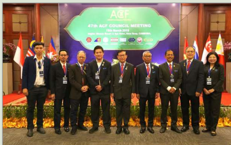
MBAM delegation to 47 th ACF Council Meeting

In the afternoon, a tour to The Cambodia Culture Village was arranged by CCA followed by a dinner hosted by Overseas Cambodian Investment Corporation (OCIC) at The Cambodia Culture Village Restaurant.