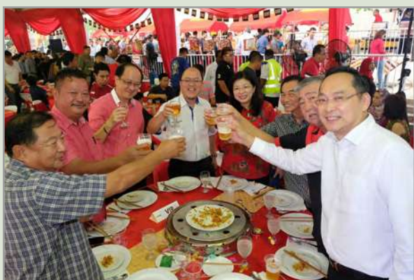
MBAM Council Members and Secretariat with invitees from other Associations

MBAM and Sime Darby Industrial Sdn Bhd organised the MBAM Fellowship 2/2019 on 8 March at Sime Darby Industrial Sdn Bhd office in Puchong. The above fellowship which also celebrated the Chinese New Year festive attracted 328 pax.