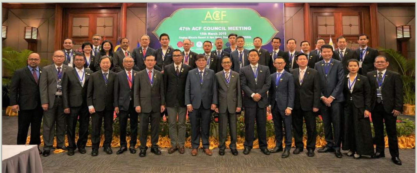
Group photo of ACF Members