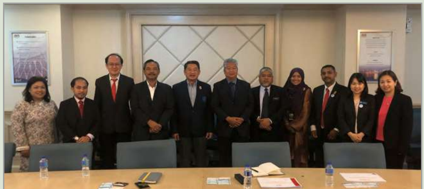
Group photo of MBAM Council Members with the team of SJPP

Advice was given to MBAM to shop around for participating banks in the scheme in order to get the best value for members.