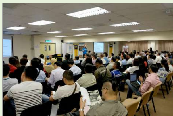
During one of the presentations