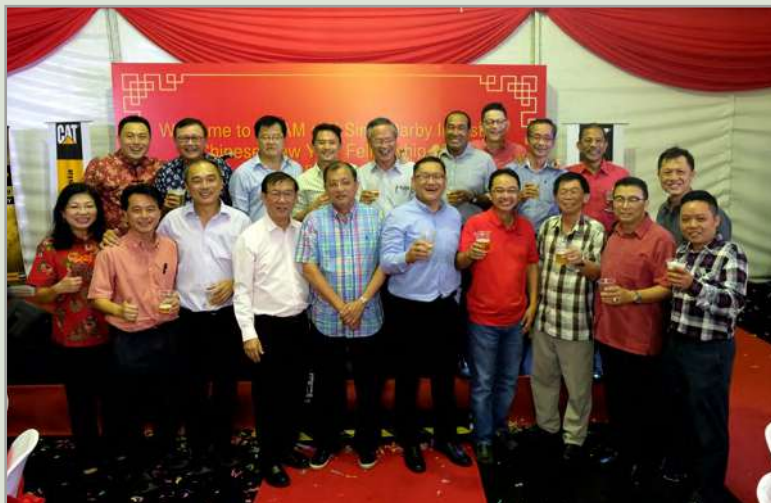
Some of MBAM Council Members posing for a photo