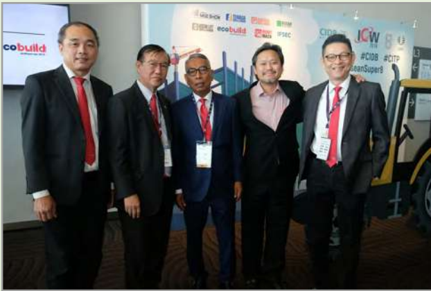
MBAM Council Members posing for a photo