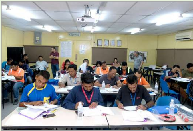
During Day 1 lessons in class