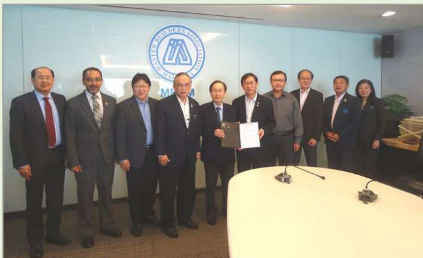
Group Photo after the 48 th BIPC Meeting