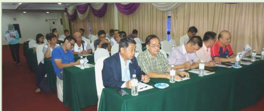
Some of the participants during the roadshow in Seremban