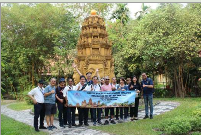
MBAM delegation at The Cambodia Culture Village