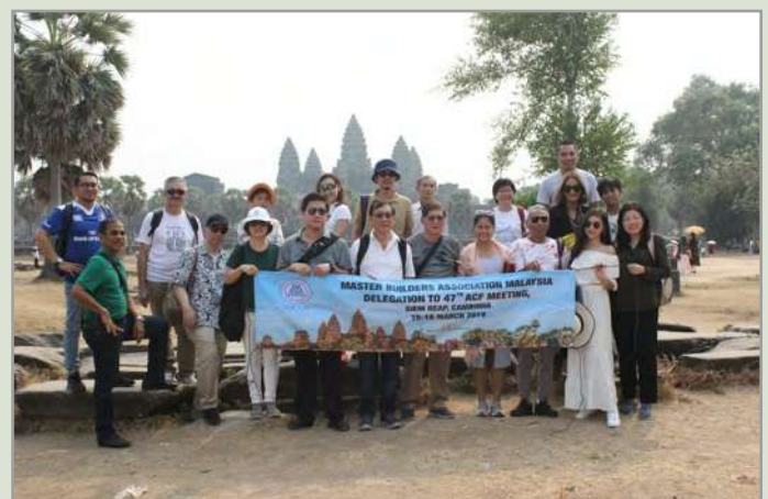
MBAM delegation at Angkor Wat