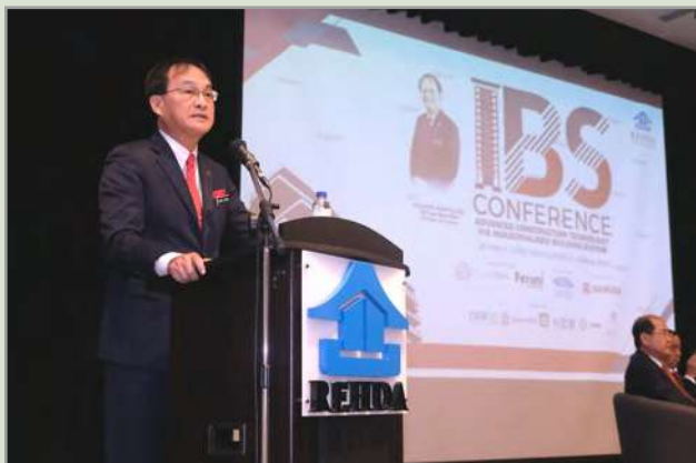
During YB Tuan Baru Bian's keynote address

IBS CONFERENCE: Advanced Construction Technology via Industrialised Building System on 26 March was organised by REHDA Institute and the Opening Ceremony was graced by Minister of Works, YB Tuan Baru Bian. MBAM was also invited to attend the Conference.