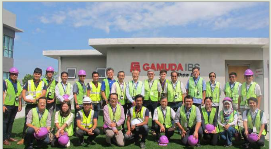
Group Photo of MBAM second visit to Gamuda IBS