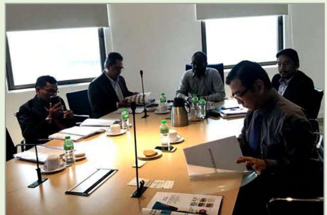
During the discussion

With the aim to enhance contractors' knowledge on the importance of the construction site waste management, the taskforce reviewed both module 2 and module 3 training materials and provided some feedback to improve the training materials. Secretariat will call for the final meeting once it is ready.