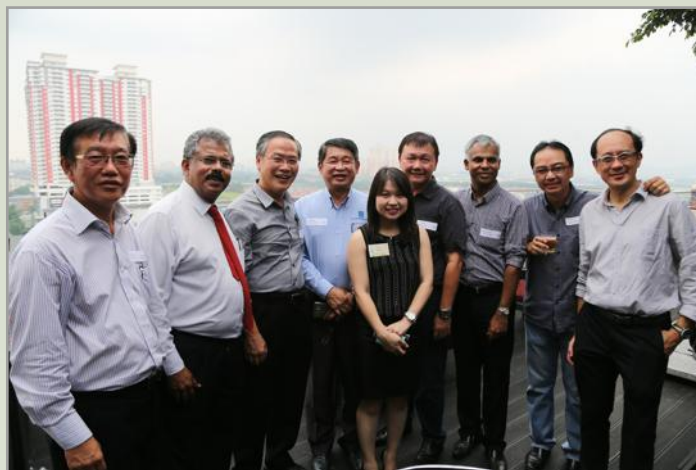
Among the MBAM Council Members attending the Karaoke Competition

MBAM President in his speech extended his warm welcome before thanking Trans Elite Group Sdn Bhd in association with Zoomlion for sponsoring the double event for that night. MBAM would also like