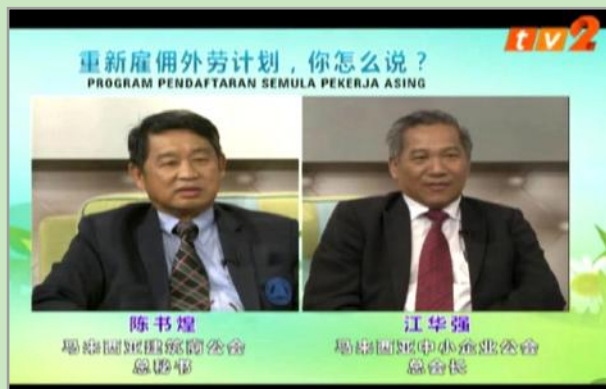
During the live interview session

However, when the new projects are launched, contractors will potentially face problems in getting enough workers to work on the projects if the suspension is not lifted soon. According to Ministry of Home Affairs there are about 2.1 million registered foreign workers in Malaysia. The numbers do not reflect the real number of foreign worker inhabitant in this country as we do not have the exact numbers for the illegal foreign workers. This is why it is important to have this rehiring programme so that the Government and the industry can have a better idea of how many foreign workers are actually in the country. To conclude, the interview was a good platform for MBAM to share our views on the foreign workers issues and provided a good exposure for MBAM to learn about how live interview sessions worked.