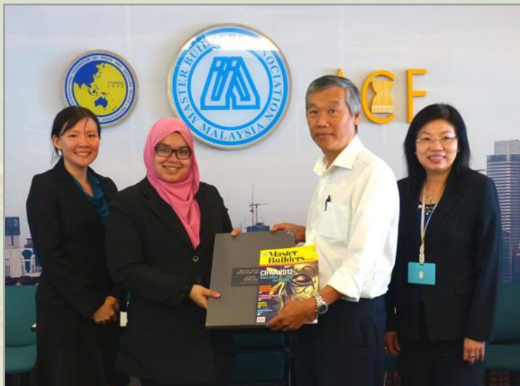
Presentation of token of appreciation