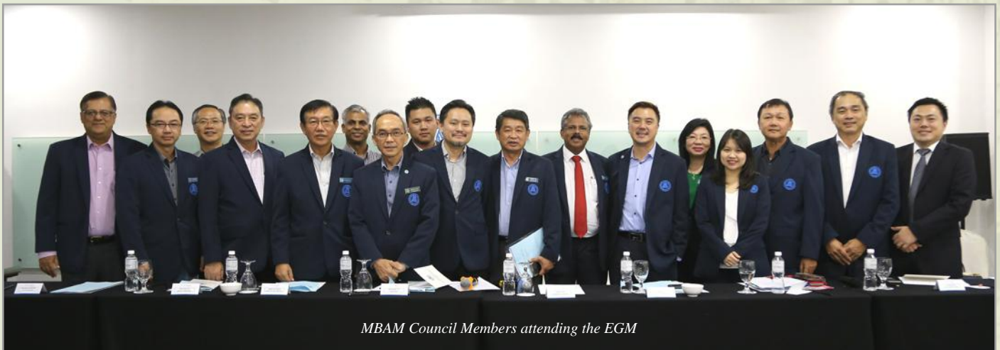
MBAM Council Members attending the EGM

The EGM then tabled the five (5) Resolutions for consideration and adoption. All the (5) Resolutions were adopted after having all members unanimously voted in favour.