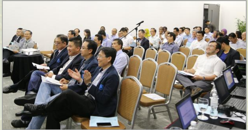
Among the members attending the EGM

This EGM's objectives were to pass the following amendments to the Constitution of the Association. The 5 resolutions, namely: