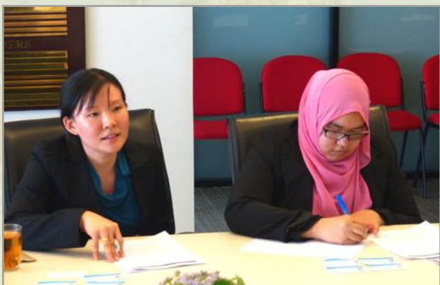
The representatives of Frost & Sullivan

Frost & Sullivan paid a visit to MBAM on 30 th March 2016 to discuss on the Migration Trends focusing on foreign labours in Malaysia. Frost & Sullivan is an international growth consulting company headquartered in USA. They have over 50 years of experience in market research and publish more than 1,000 reports across various industries worldwide. Therefore, through this meet up with MBAM, they hope to have a better understanding on the current landscape,