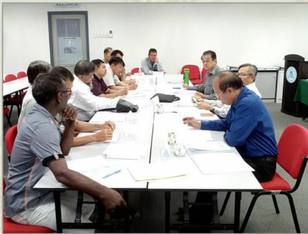
Interview session in progress

The said programme is fully funded by the Construction Industry Development Board Malaysia (CIDB) with the primary objective to certify and register construction site personnel, in particular site supervisor, site agent and site foreman. This initiative is in line with amendments made to CIDB Act 520 in 2011 where CIDB Malaysia is committed to: enhance the image and professionalism of the construction industry and to continuously improve the competency of construction personnel through certification and registration.