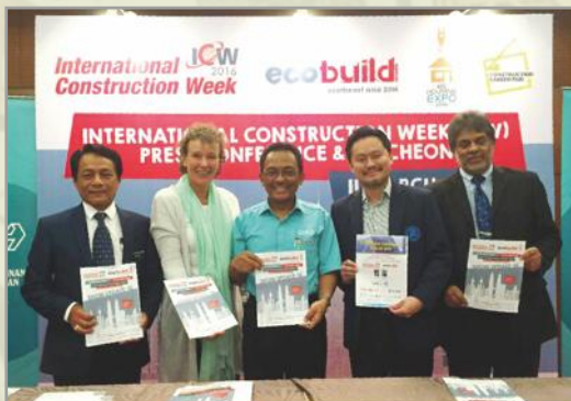
Group photo with the main organizers in conjunction with the ICW 2016