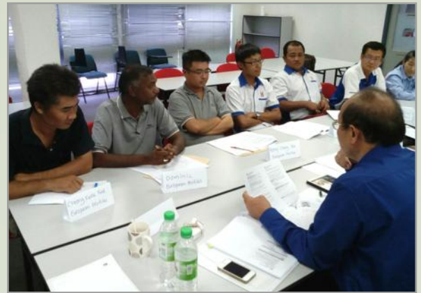
The candidates for the COCD programme during the interview session

Interview session for the 6 th intake of the pilot project for the Construction Occupational Competency Development (COCD) Programme for Construction Trade Supervisor (Foreman) was successfully conducted on 11 th March 2016 at MBAM Training Centre. A total of 20 participants from MBAM Council Member companies and MBAM Member companies were shortlisted in this programme. The six and half (6 ½) days course will run from 5 th April 2016 to 24 th May 2016 at MBAM Training Centre.