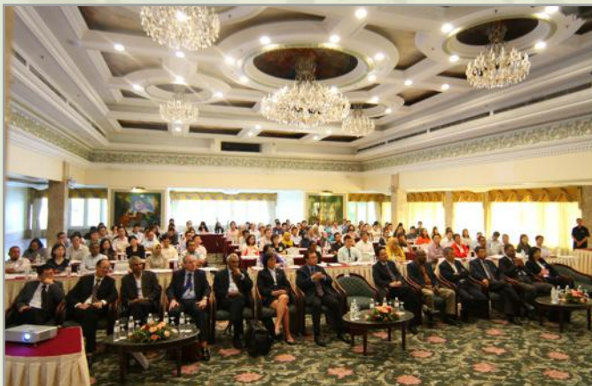
The full house attendance at the seminar