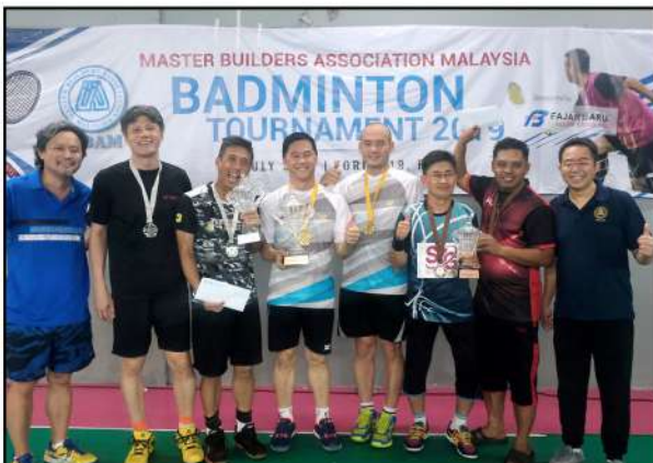
Winners for Men Doubles Combined Age 91 Years and Above