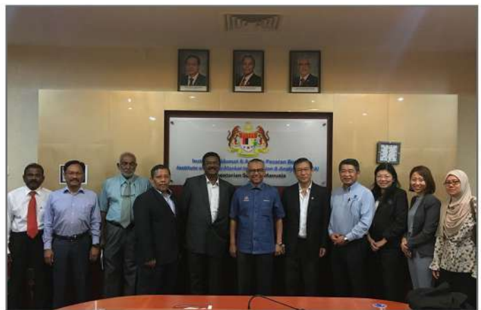
Meeting with Institute of Labour Market Information and Analysis

The objectives of the meeting were to discuss human resources matters which covers foreign workers replacement quota system via Check Out Memo (COM), amendments to labour laws, and the proposed multi-tier levy system whereby it was noted that the reinstated system is more complex in terms of application process and time consuming. Hence, the multi-tier levy system defeats the purpose of expediting the replacement of foreign workers with minimal hassle.