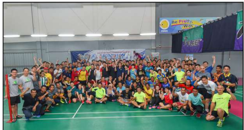
Group photo of all players

After a day of tough and back-to-back match schedules, the winners are as follows: -