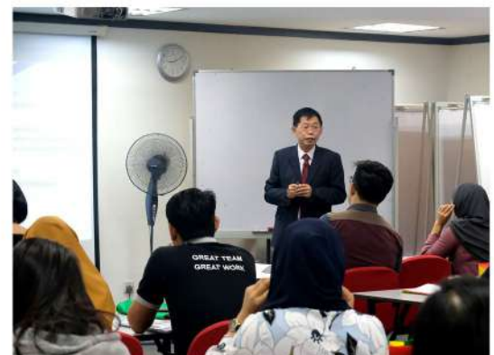
During the Session 4 training