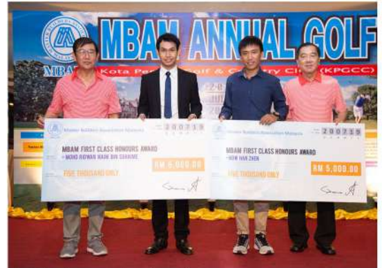
First Class Honours Award recipients