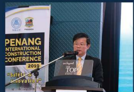
Address and Official Opening by Guest of Honour, Penang Chief Minister, YAB Tuan Chow Kon Yeow