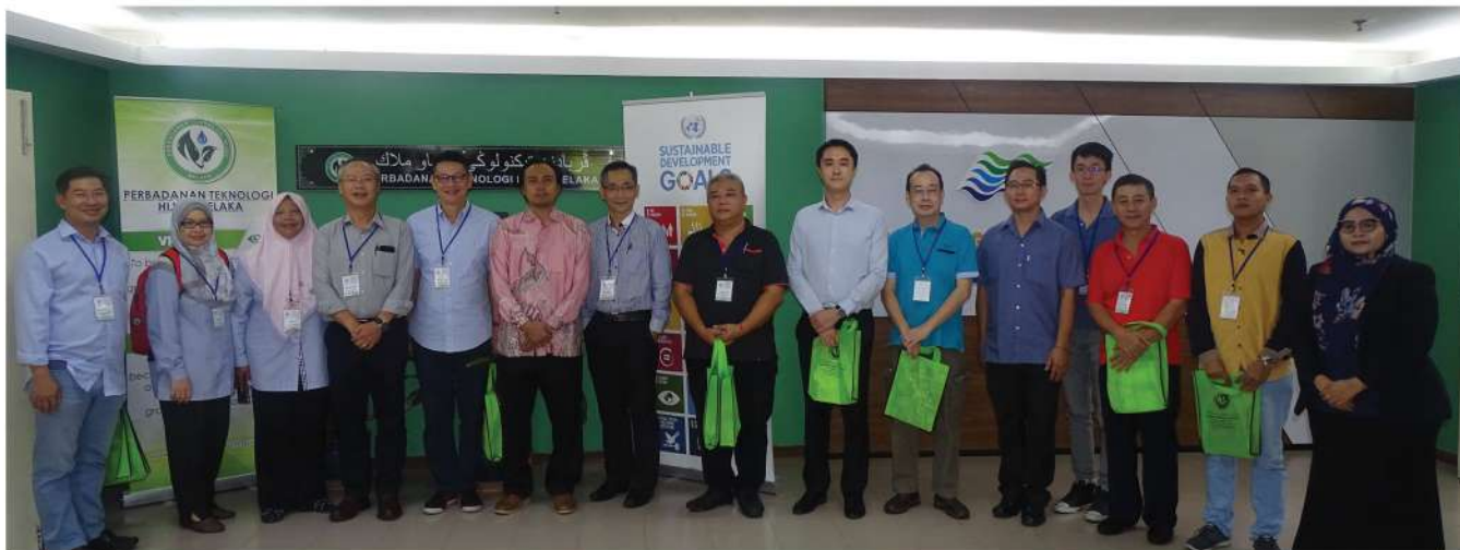
Technical Visit to Melaka Green Technology Corporation (MGTC) - Group Photo