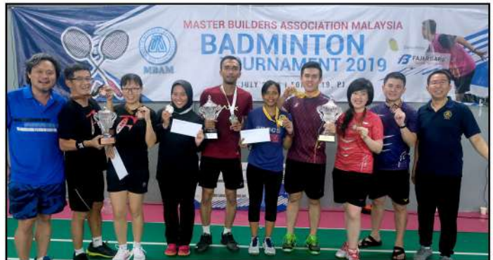
Winners for Open Mixed Double Category