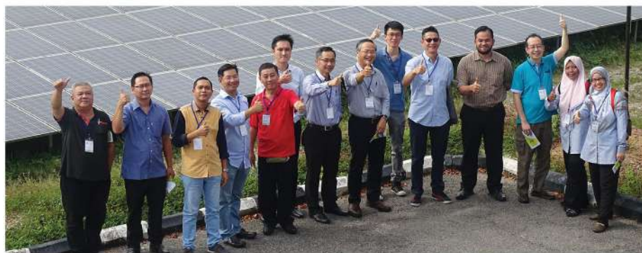
Delegates at Kumpulan Melaka Berhad (KMB) Solar Farm in Alor Gajah

The final technical visit is to visit the backstage of Encore Melaka. The theatre which rotates 360 degree with multi-stage hydraulic sets and innovative video projection mapping technology is used to create stunning visual effects and to complement the props and traditional costumes and contemporary dance performance by 200 local performers. The visit was conducted after watching the Encore Melaka show, a heritage and cultural performance show.