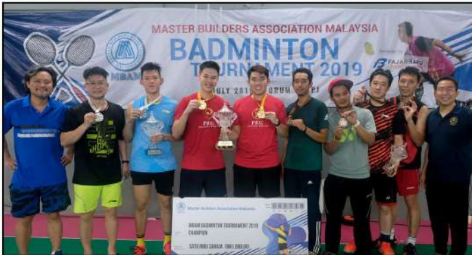
Winners for Men Doubles Combined Age 90 Years and Below Category