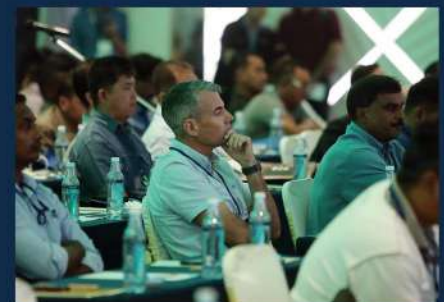
Participants listening diligently during the Conference

In conclusion, the first edition of the Penang International Construction Conference 2019, themed "Safety & Innovation" which saw 10 very insightful paper presentation by a mix of local and International experts of the industry, provided diverse views, knowledge, experiences, lesson learnt and ways forward in improving the safety and health panorama of the Malaysian construction industry.