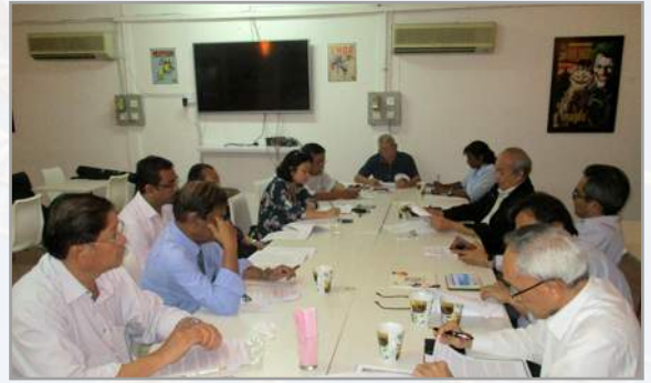
During the Council Meeting