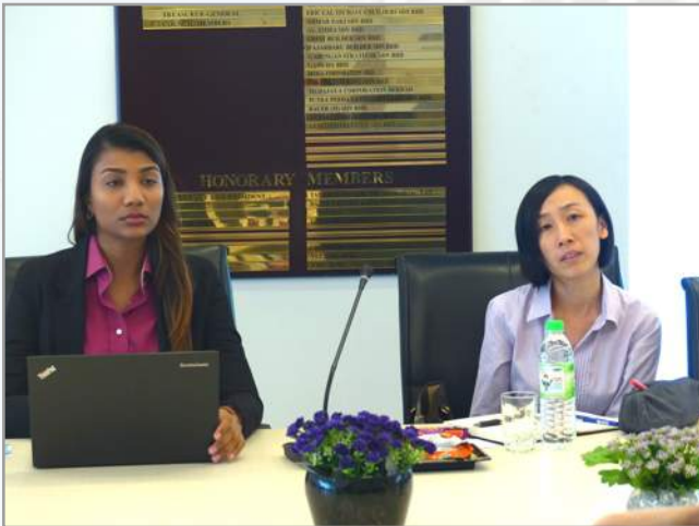
The representatives from PWC Consulting Services (M) Sdn Bhd

Overall the meeting was productive and gave an insight on the possibility of getting more workers for the construction industry in the future.