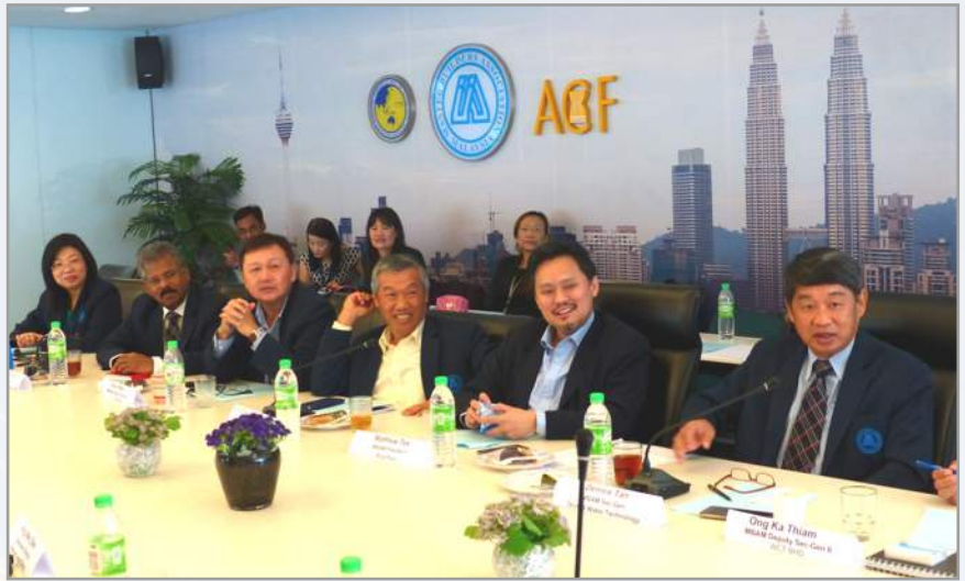
Among the MBAM Council Members attending the focus group meeting