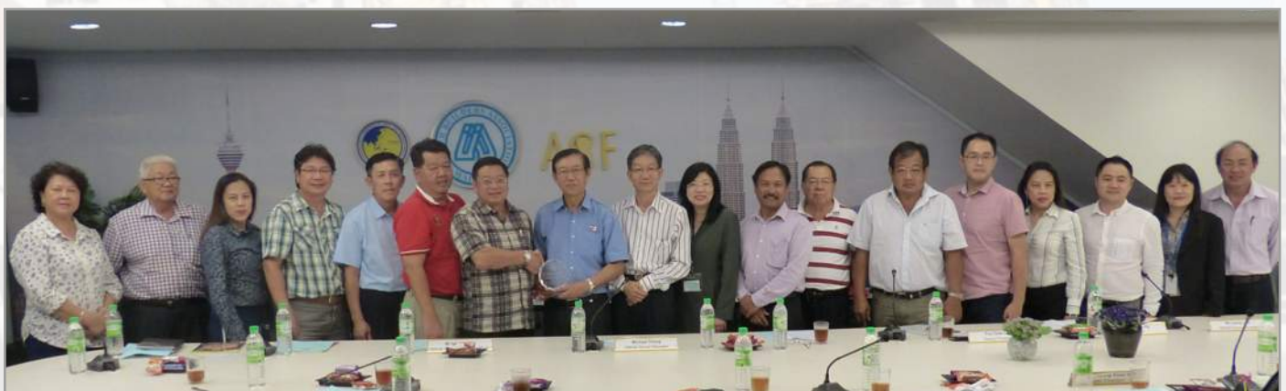
Group photo with the representatives from SBA