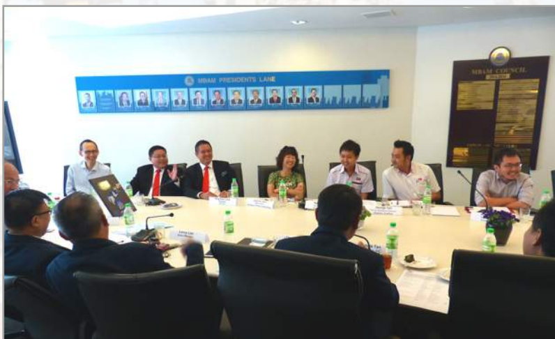
MBAM members putting their issues across to MBAM Council representatives