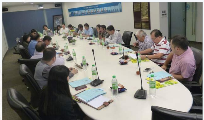
Meeting in session