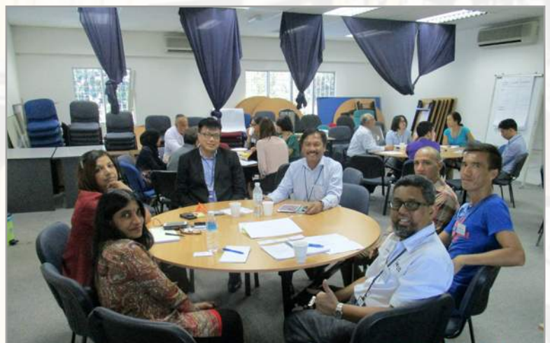
Group photo of attendees for UNHCR Market Survey and Value Chain Analysis briefing session