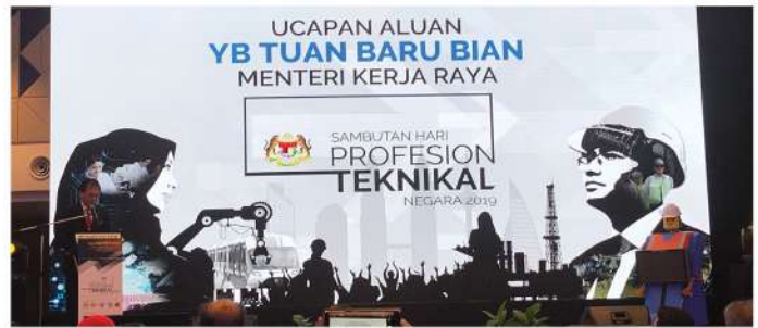
Welcome speech by Works Minister, YB Tuan Baru Bian

The inauguration of National Technical Profession Day 2019 was held on 3 December at TM Convention Centre and was jointly organised by Ministry of Works, Public Works Department (JKR), TM One, Malaysia Highway Authority and Pertubuhan Profesional JKR Malaysia. The idea of Technical Profession Day was mooted by JKR in early year 2012 for an appreciation of the contribution and recognition of technical professionals in Malaysia.