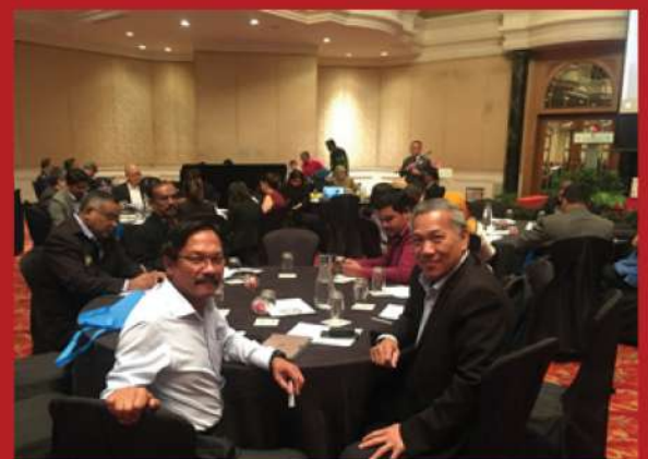
Mazlan with other attendees

Later that afternoon, the programme continued with a dialogue session with Minister of Human Resources Malaysia, YB Tuan M. Kulasegaran and Deputy Minister of Human Resources Malaysia, YB Dato' Mahfuz Bin Omar. All the groups presented their outcomes of discussion during the FGD.