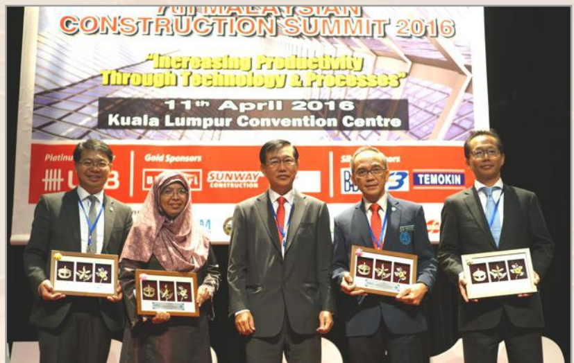
The speakers for the first session of the 7 th MCS