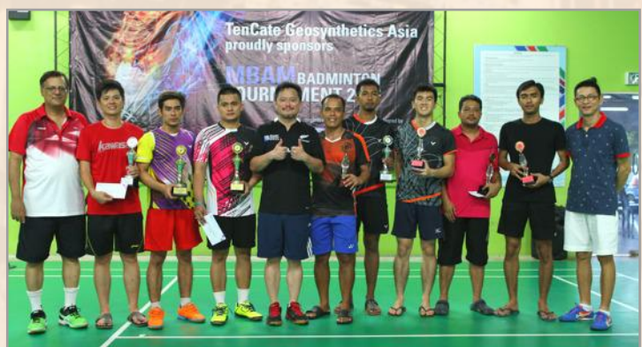
The winners for the Men Doubles combined age 90 years and below category

On 23 rd April 2016, MBAM organised the MBAM Badminton Tournament 2016 at the Champion Badminton Court, Petaling Jaya. This is the 2 nd outreach programme for this year after the MBAM Karaoke Competition back in March. Sponsored by Tencate Geosynthetics Asia Sdn Bhd, the Tournament managed to break the previous year's record with a total of 90 pairs joining this year. There were 28 pairs for Open Mixed Doubles, 16 pairs for Men Doubles combined aged 91 years and above and 46 pairs for the Men Doubles Combined aged 90 years and below. The winners for this year's tournament were: