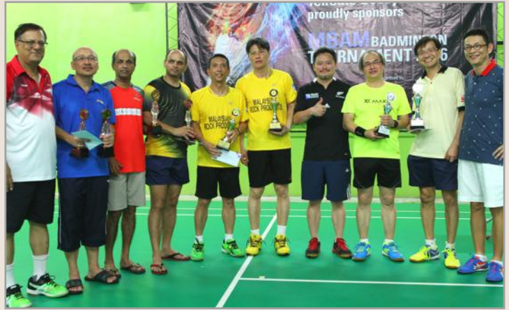
The winners for the Men Doubles combined age 91 years and above category