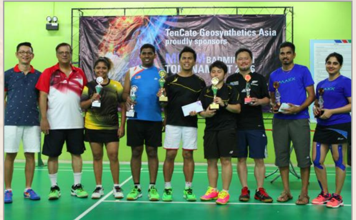
The winners for the Open Mixed Category