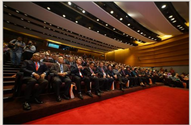
Among the crowd during the opening ceremony

The Summit, which was well attended by 356 participants, was separated into two sessions, with three speakers each, with each session concluding in a moderated panel discussion. The internationally renowned speakers for the Summit were: