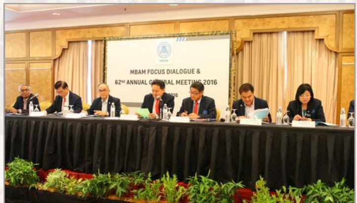
The MBAM Office Bearers