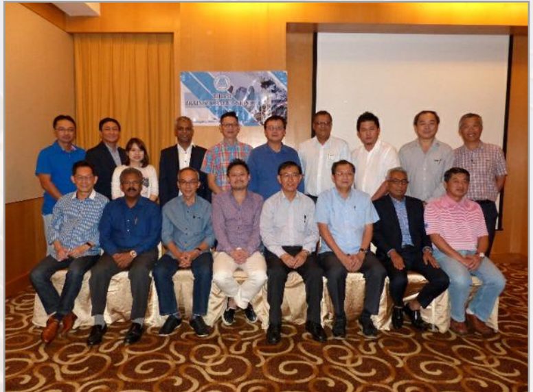
Group photo of MBAM Council Members