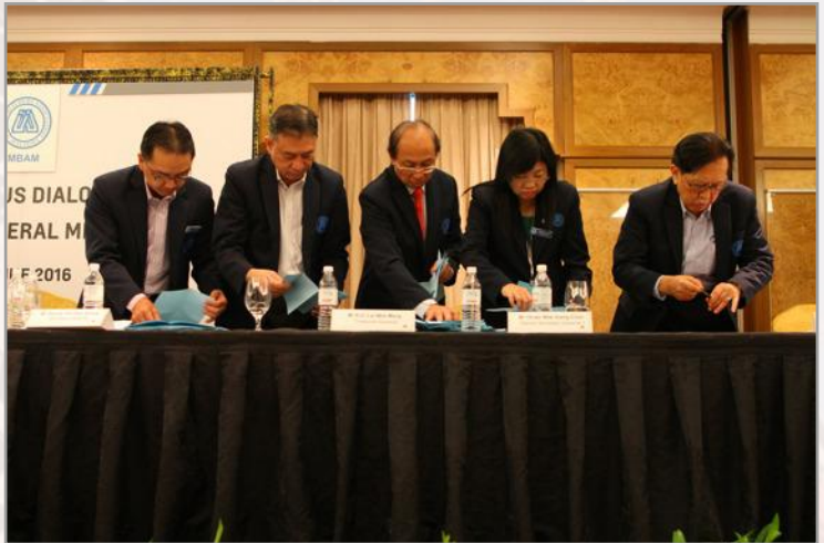
During the counting of the Ballot Paper

During the 62 nd MBAM AGM, we also presented the certificate of membership to new MBAM members as follows:-