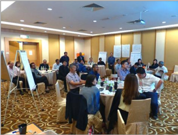
During the Brainstorming Session