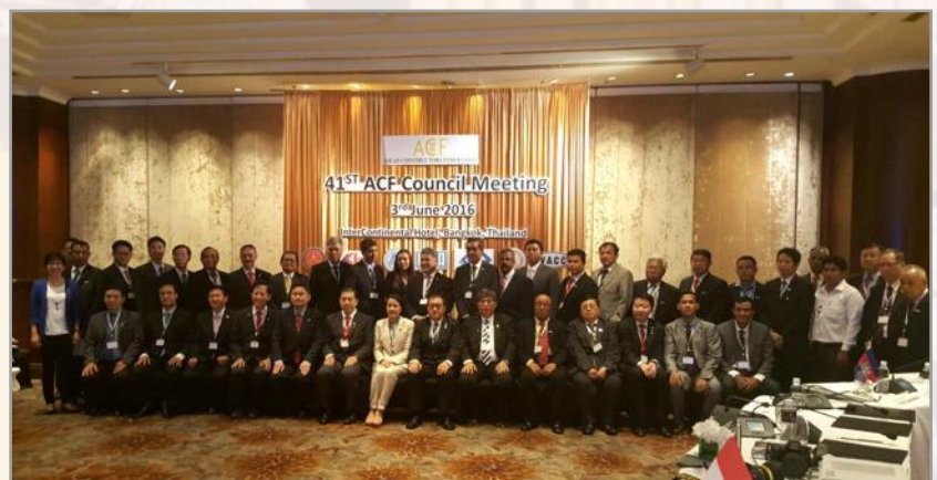
Group photo of all ACF Council Members