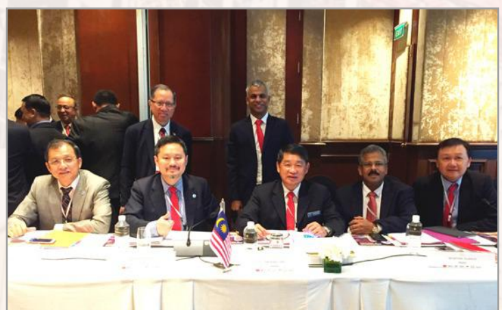
Representatives from MBAM

Overall, the meeting was fruitful and informative.