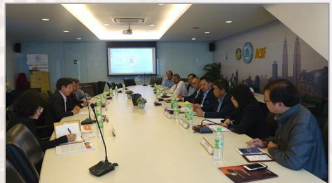
During the Discussion

Also in attendance were the following MBAM secretariat staff: