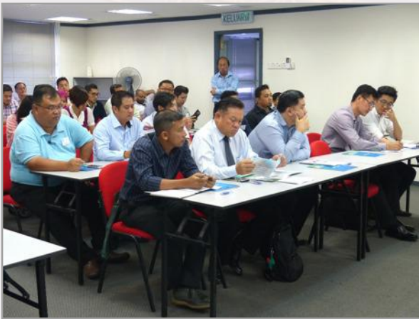
The participants attending the Talk

The following were the speakers for the talk:-