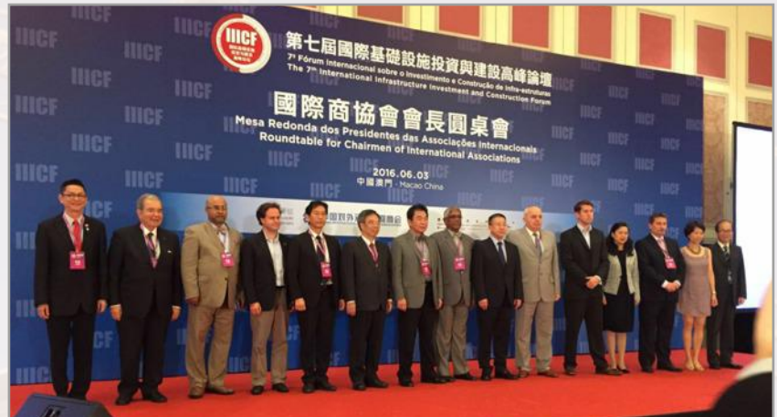
The delegates from various countries

The theme of the 7 th IICF is “ Innovating Construction-Finance Cooperation and Energizing Infrastructure Development ”. At present, the international infrastructure investment and construction market sees a strong demand yet a large funding gap exist worldwide. In this context, how to unlock the financing bottleneck has become a critical challenge facing all stakeholders. To find a solution, governments, financial institutions, and enterprises across countries are updating their collaborative model and leveraging the combined advantages of construction and finance.