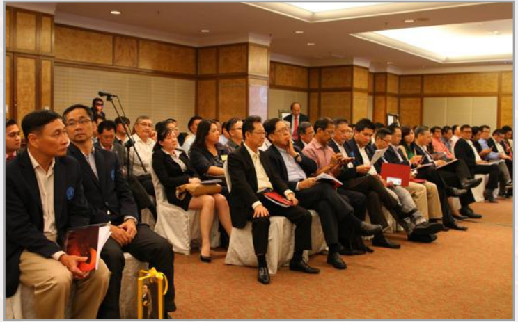
Among the attendees of the 62 nd AGM