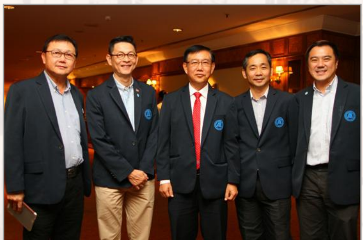
Group Photo of MBAM Council Members

In conclusion, the dialogue was an effective way to bring together members to deliberate issues. Altogether there were 57 participants attending the dialogue including MBAM members' secretariat staff.