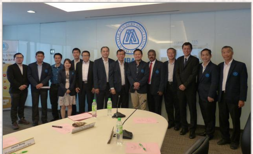
MBAM Council Members for the Term 2016/2018