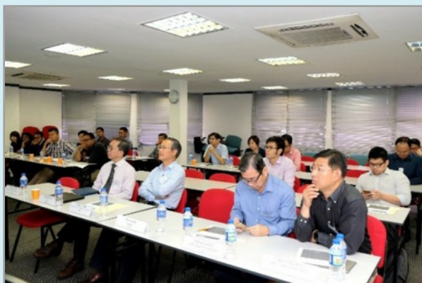
M&E Talk on Air Conditioning & Air Distribution System

62.1, 2010 an 'acceptable Indoor Air Quality (IAQ) is defined as "air in which there are no known contaminants at harmful concentrations as determined by cognizant authorities and with which a substantial majority (80% or more) of the people exposed do not express dissatisfaction". In addition, the typical design criteria for thermal comfort relating to the building occupants is dependent on air temperature, radiant temperature, air speed, relative humidity, vertical temperature gradient, metabolic rate and type of clothing building occupants commonly wear.