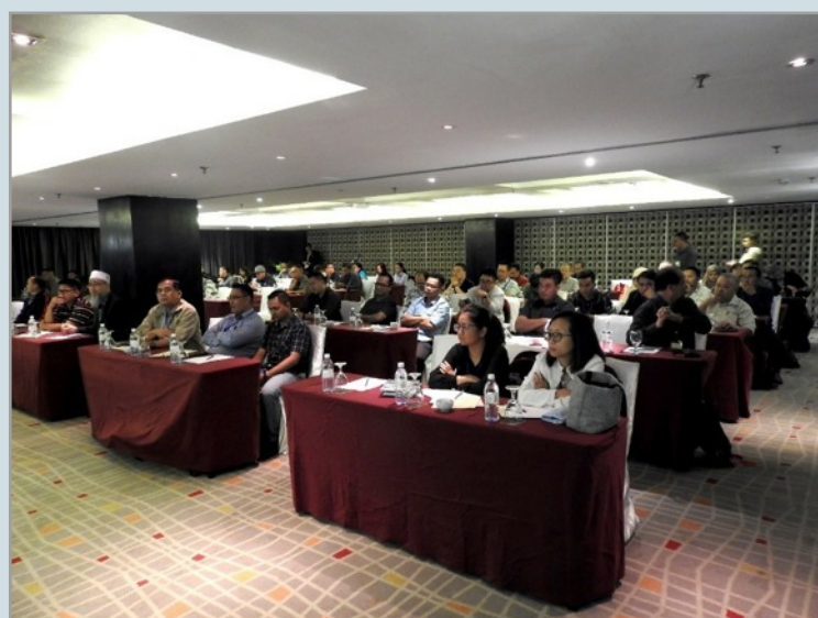
The seminar received favourable response from participant