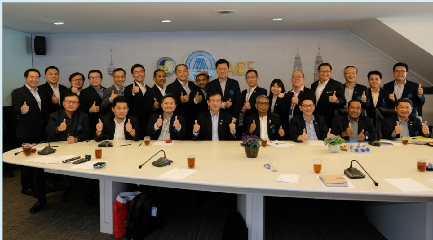
Group Photo of MBAM New Council Members

I would like to take this opportunity to congratulate all the new office bearers for the term 2018-2010. We hope to serve members better and to do that we hope members can give constructive feedback on how to take this Association to the next level.