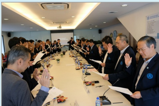
Swearing in new MBAM Council Members

The following are the MBAM Council Members for the term 2018 - 2020: