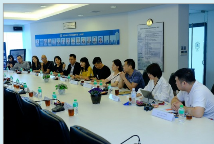
Delegates from Foshan Ceramics Industry Association (FCIA) accompanied by Malaysia-Foshan Chamber of Commerce (MFCC)