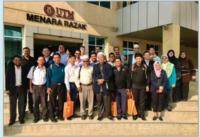
Group Photo for OSHCIM Workshop in Menara Tun Abdul Razak, UTM KL on 19 th July 2018.

the risks in the construction project. Therefore, in this workshop, it is believed that promoting safety by design as decision made in planning and design stage can have safety and health implications in the later stage of construction. Design professional can have a significant impact on construction injuries and fatalities by considering hazards in their design, hazard Prevention Through Design (PTD).