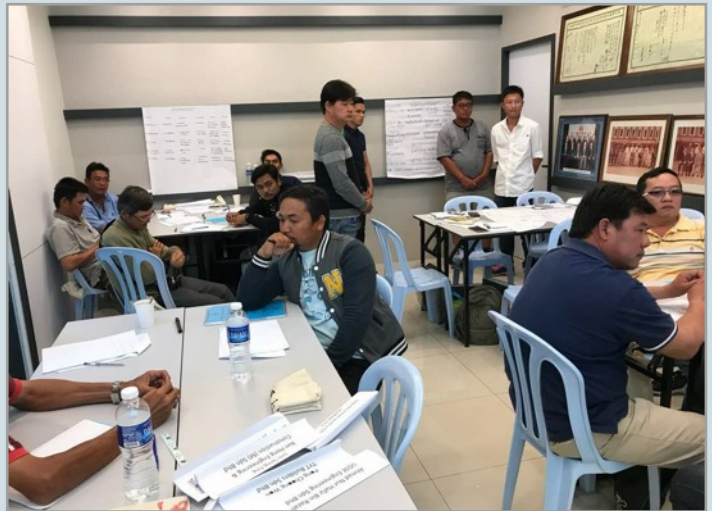
The participants of the programme

The module Systematic Problem Solving & Decision Making Skills focused on problem solving, pitfalls in decision making and range of action in decision making process. The other modules: Effective Project & Scheduling Using Critical Path Analysis (CPA) Method focused on project planning and scheduling method.