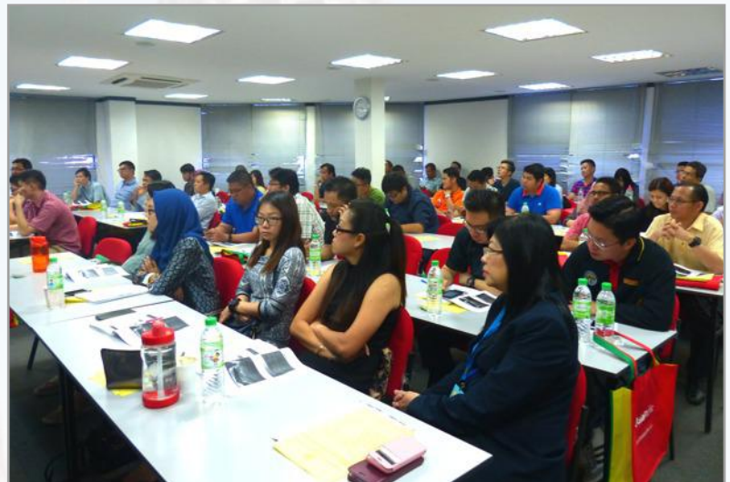
Among the participants attending the seminar

Overall it was a well-received training and MBAM look forward to planning a better and more detailed programme for members.