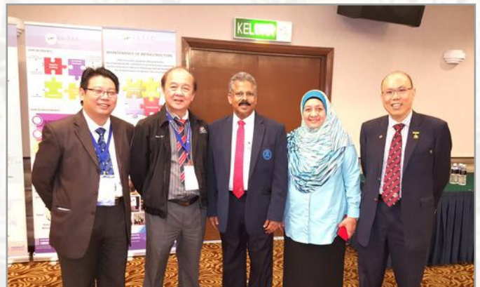
Group photo with the representatives from MSPC, IEM and CIDB