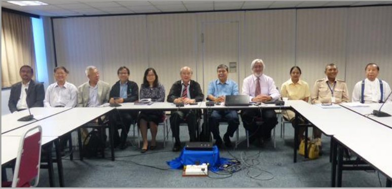
Group Photo of some MSPC Council Members