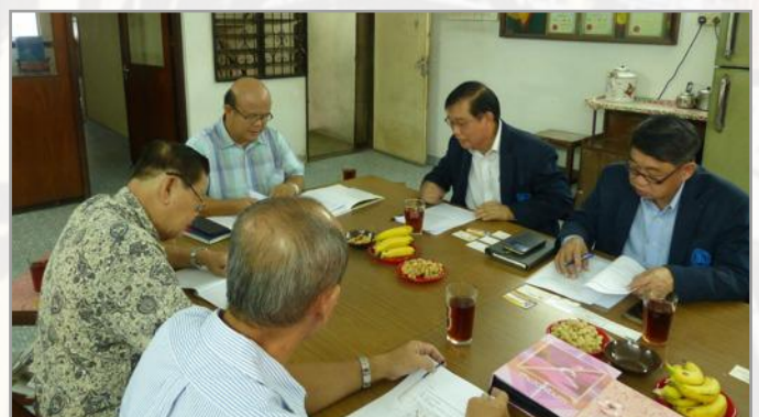
In discussion with Perak Contractors Association