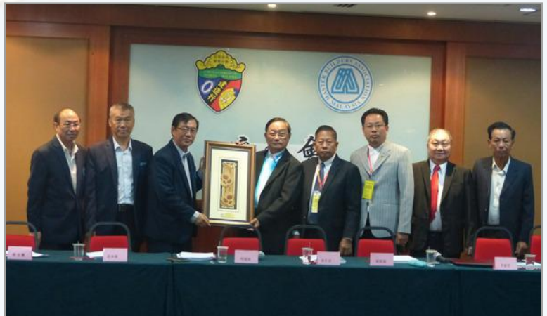
Presentation of souvenir to the Gabungan Persatuan-Persatuan Pembina Malaysia