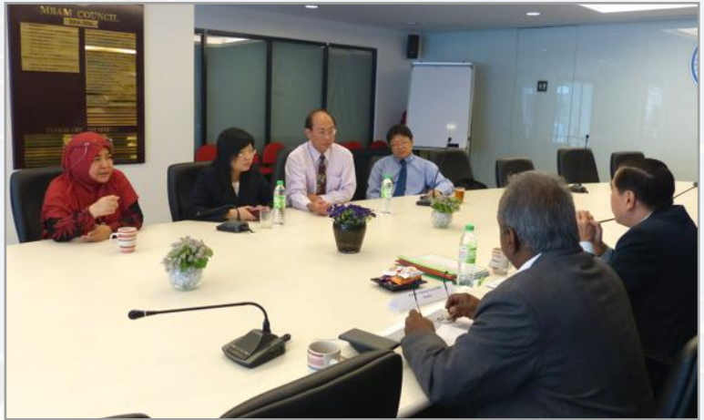
During the Discussion session to finalized the recipient of the MBAM Education Fund Scholarship