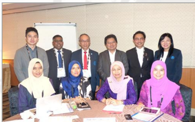
The Pre-Graduate discussion group