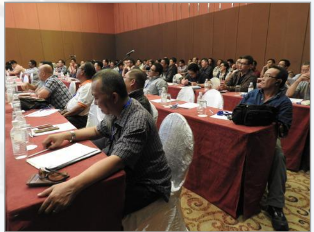
The participants of OSH Sabah