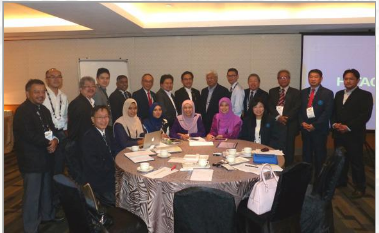
Group photo with the attendees of the roundtable meeting

Under the Pre-Graduate Segment, it was recommended that there is a need to increase the quantity and quality of lecturers and that more research and development to be done focusing on industry needs. Recommendations were also made for lecturers to undergo industrial training and for retired professionals to be