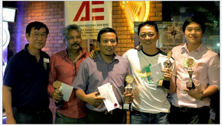
The winners for the Pool Competition

The event managed to bring together members of MBAM under one roof for a day of fellowship and games. All together it was a successful event.