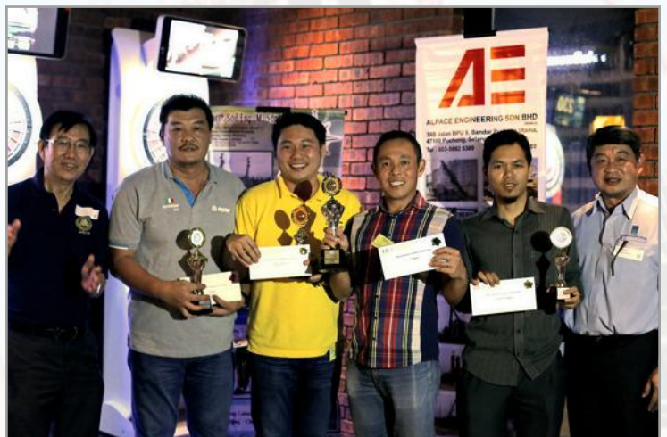
The winners of the Darts Competition