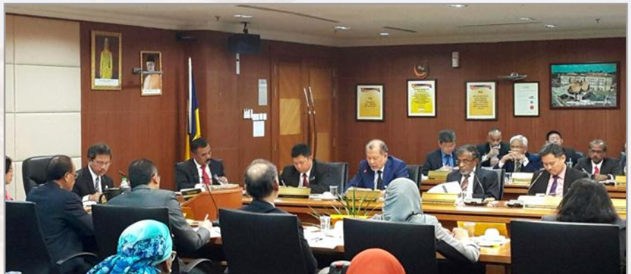
During the meeting