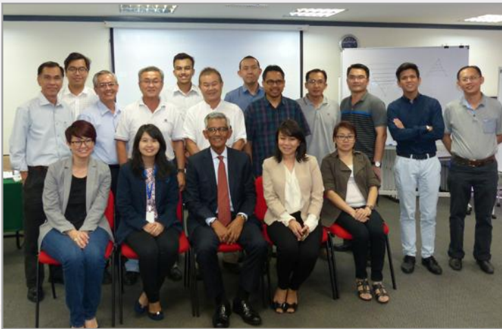
Group photo with the participants of the PR Training

a professional emcee and is one of the few who can emcee fluently both in Malay and English. This one-day seminar proved to be useful for MBAM Members in understanding the role of public relations and how to go about conducting it. The training was attended by 16 participants who came from various communications related backgrounds.