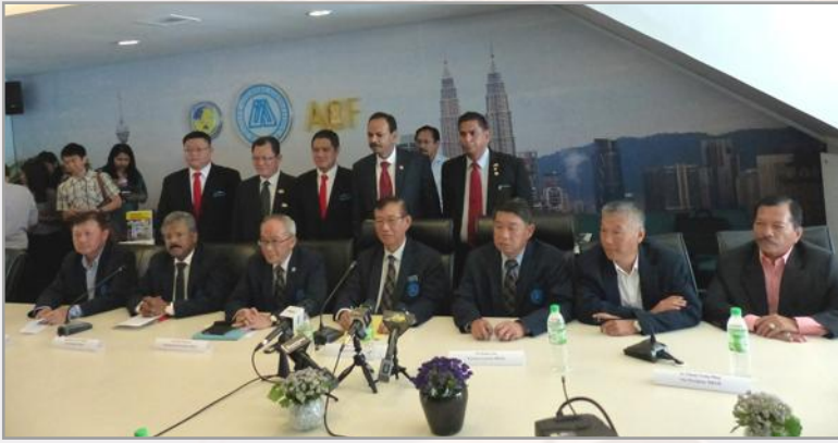
The representatives from MBAM, PKIM, GBC, BMDAM and MACRA