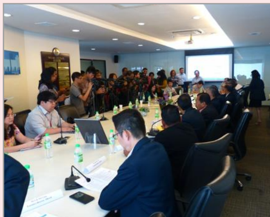
Among the media attending the press conference

On 3 rd February 2016, MBAM held a Joint Press Conference in Tan Sri Datuk Tee Hock Seng Conference Room where the industry urged the Government to immediately withdraw the hikes in foreign worker's levy. The press conference was also held to appeal to the Government to urgently review and simplify the entire registration process and legalise the illegal foreign workers already working here as soon as possible.