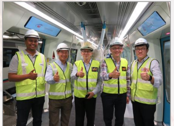
Inside the train

During the visit the delegates were brought to see the Infrastructure Workshop & Works Train Stabling, Rolling Stock Maintenance Office, Electric Train Workshop, Car Body Wash Plant, as well as the Administration Building & Operation Control Centre. Overall, the feedbacks from the participants were that the study visit was educational and had enhanced their knowledge on the subject.