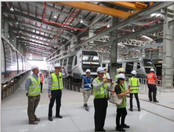
The participants at the depot