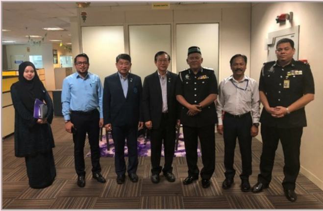
Courtesy Visit to The Immigration Of Malaysia - Foreign Workers Division

a new government hence are stopping supplies to other countries. This has resulted in the unavailability of workers even though the system is running. In addition, employers have to change their source country to acquire foreign workers. However, other countries prefer to work in Middle East rather than Malaysia.