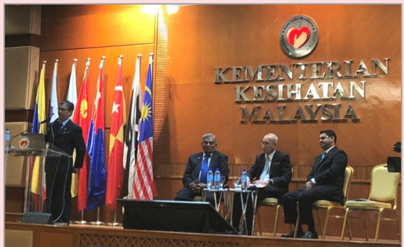
Panel Discussion During Town Hall Session

The town hall session concluded that Ministry will do the summarization and table in the Cabinet for approval based on general practitioners', employers' and the public's views.