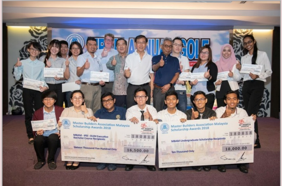
Group Photo with the Scholarship Recipients

Collectively, the total scholarship awarded for year 2018 is RM381,000/- over their duration of studies and to-date we have disbursed almost RM2.20 million since its inception in 1999.