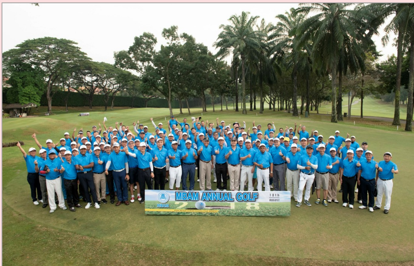
MBAM Annual Golf 2018 Organising Committee successfully organised the MBAM Annual Golf 2018 on 18th August 2018 at Kota Permai Golf and Country Club, Shah Alam